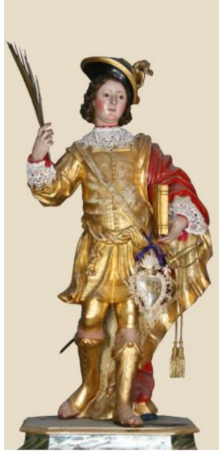
Fig. 3 - Duomo of Cagliari, altar of San Isidoro: statue of San Saturnino.