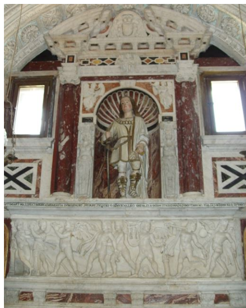
Fig. 2 - The altar of S. Saturnino in the "Martyrs' Sanctuary" at the Duomo of Cagliari.

San Saturnino is the patron saint of Cagliari and is celebrated on 30th October.