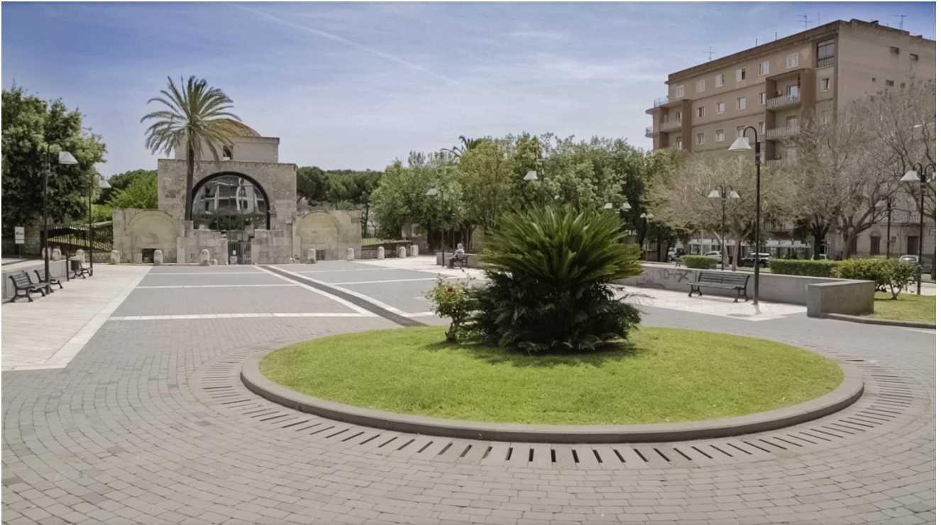
Fig. 1 - Piazza Sa Cosimo: the well was found where the flowerbed is now.