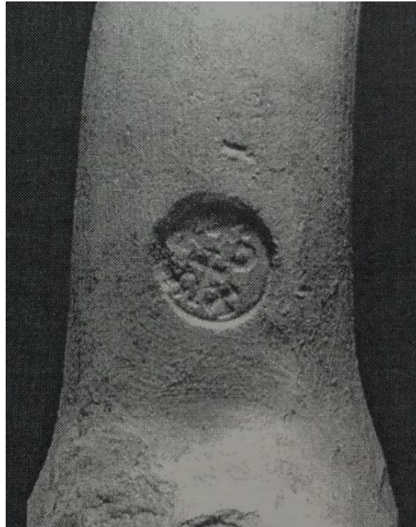
Fig. 2 - Cagliari, S. Saturnino: fragment of an amphora with the imprint of a coin from the time of Constantius II (From Salvi 2002, p. 225).