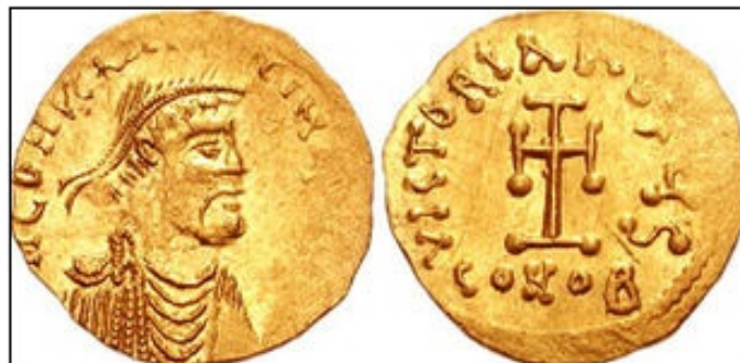
Fig. 3 - A gold coin from the time of Constantius II (from https://it.wikipedia.org/wiki/Costante_II ).