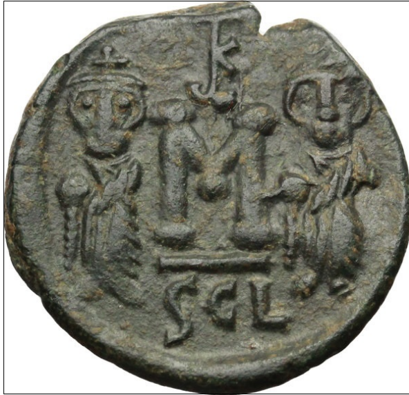
Fig. 4 - A Constantius II coin (from http://www.deamoneta.com/ ).