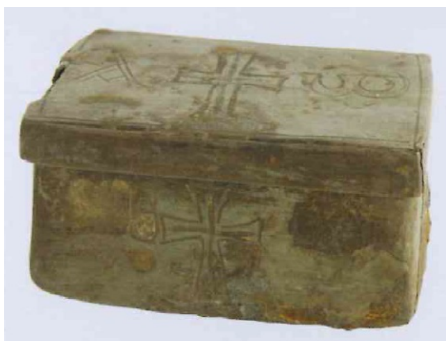
Fig. 3 - Silver reliquary from the church of Sant' Andrea, Rimini, 5th-6th century (From http://www.crocifisso.rimini.it/storia/ ).