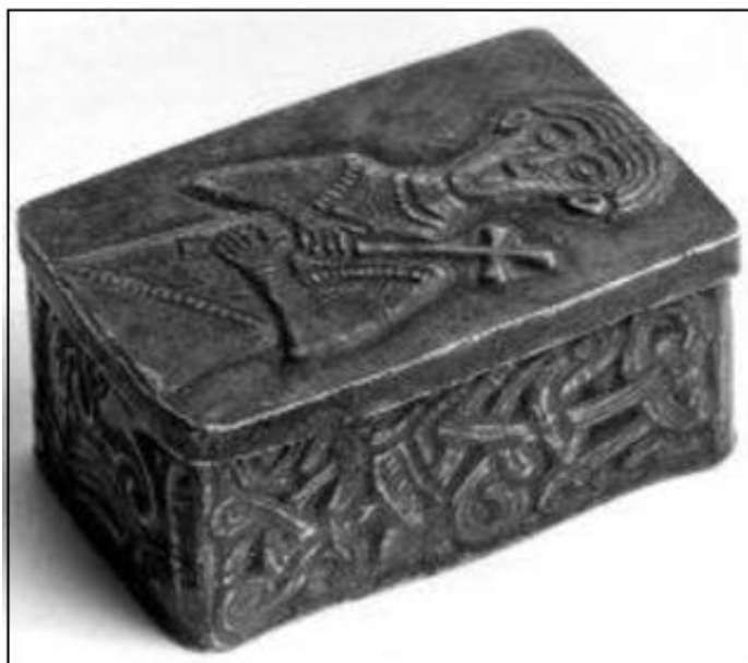
Fig. 2 - Silver reliquary of Sant'Apollinare, 6th-7th century.