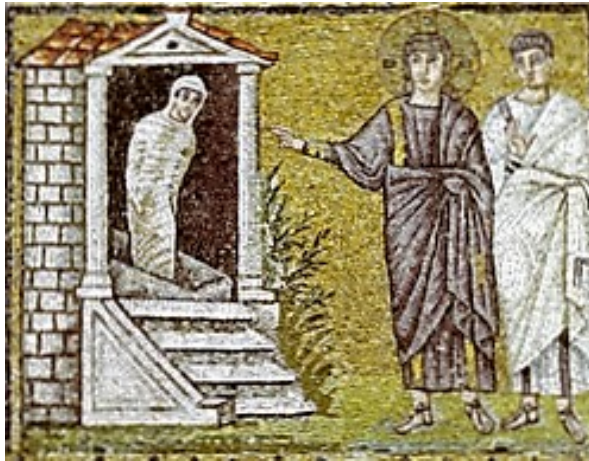
Fig. 3 - Resurrection of Lazarus, mosaics of San Apollinare Nuovo, Ravenna, 5th-6th century (from http://www.mosaicocidm.it/Mosaico/Read_full.action%3Bjsessionid=A62056260E798CB40C0E1228636CC8BB?cardNumber=61&leaves=0 ).