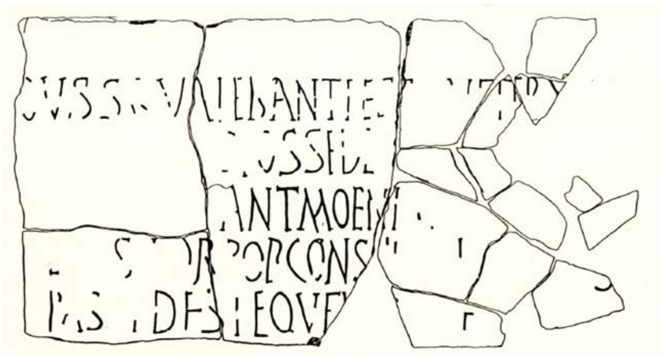
Fig. 2 - Graphic reconstruction of the inscription: side mentioning moenia (from Sotgiu 1990, p. 208, fig. 2).

The side hidden for several centuries in the ground (fig. 3) shows a text that can be dated 6 : Salvis d(ominis) n(ostris tribus) Flaviis Gratiano, V[alentiniano / The]odosio, invictissimis princip[ibus. Thermae] / aestivae quae olim squalor[e et magna] / ruina fuerant conlabsae a [fundamentis (?)] / constitut[ae] nunc de fonte du[---] i.e. In the period in which Gratian, Valentinian and Theodosius (379-384) were emperors, the summer thermal baths that had fallen into ruin were restored 7 .