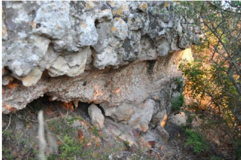
Fig. 5 - Stretch from the aqueduct (from Fantauzzi, De Vincenzo 2013, p. 3, fig. 3).

The finding of summer thermal baths are extremely rare and the integration proposed for the Cornus inscription ([ Thermae ] / aestivae ) may come from a passage by Historia Augusta according to which Gordian III has one built sui nominis in 240 circa 14 . As the structures interpreted as thermal baths at Columbaris are placed in the 3rd century, similar to the ones the emperor had built, a diffusion of this type of building could be hypothesised in the same century 15 .