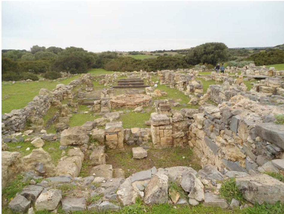
Fig. 1 - Baptistery basilica, view from the East.

During the 1964 investigations of the basilica used for baptisms (fig. 1) 1 sixteen fragments of marble inscription have been found in the floor 2 . It was only noted that the items were opisthographic when recovered 3 : the engraved text is difficult to read on the side walked on by worshippers who moved around the basilica and seems to refer to the renovation or the building of town walls 4 , in fact in the fourth row, the word moen[ā] , «walls», preceded by ant , a probable final part of a verb can be clearly seen, that may be [fecer]ant, «they had done» (fig. 2). According to L. Pani Ermini this reference is a confirmation of the renovation that the walls of the baptistery underwent 5 .