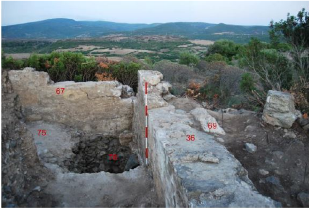
Fig. 4 - Corchinas, north-east sector of the hill, thermal bath structures (from Fantauzzi, De Vincenzo 2013, p. 12, fig. 16).

The size of the stone wall coverings and the finding of the several tegulae mammatae 10 in this sector brought the finders to interpret the structure as a thermal bath area, that can be identified by the words thermae aestivae mentioned in the inscription; the traces can be dated to the last quarter of the 4th century A.D. based on the materials found, a time compatible with that of the inscription of the three emperors. A further element supporting this interpretation is the integration of du[ctus aquae] 11 «aqueduct» (fig. 5), the remains of which were found along the south-east border of the ridge to the east of Corchinas, a short distance from the thermal bath area 12 . The construction of public works - like the aqueducts or walls - were completed by wish of the emperors: this work had to be remembered and associated with the name of the emperor on the inscriptions 13 .