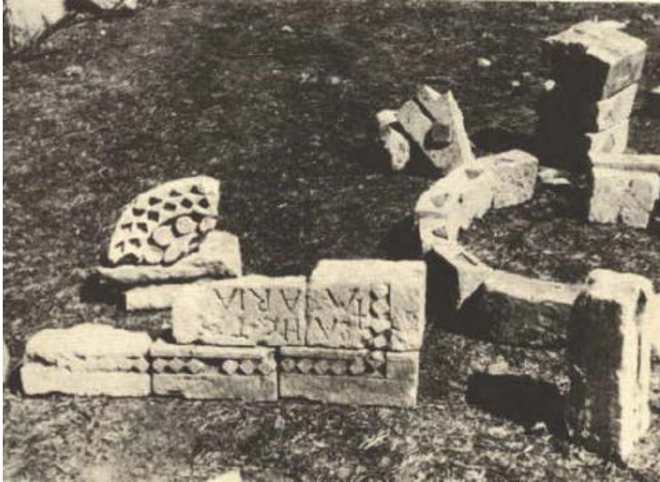
Fig. 3 - Architectural elements: part of the inscription in the foreground (from Maetzke 1971, p. 335, fig. 18).