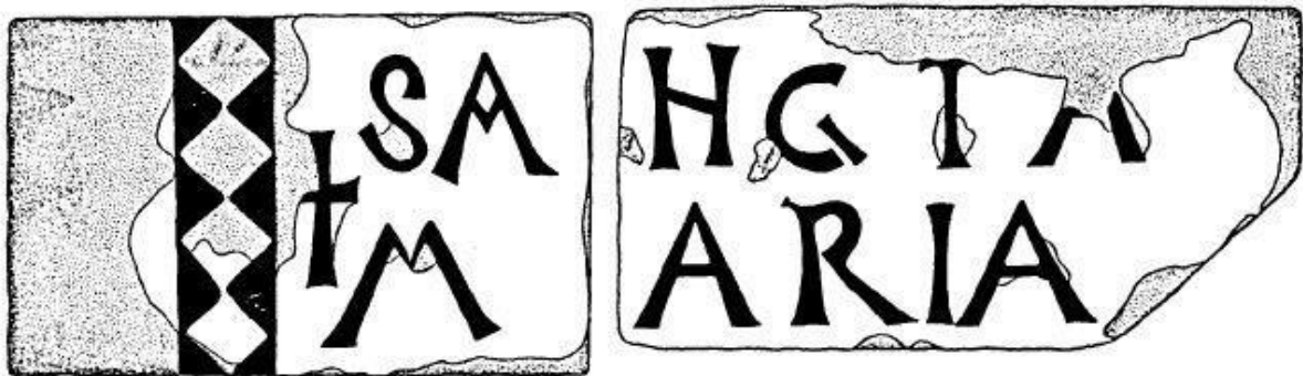
Fig. 4 - Fragment of the inscription in which the letters interpreted as "Sancta Maria" appear. (from Mastino 1984, p. 167, fig. 25).

The elements with engraved decorations are characterised by limestone blocks with red trachyte geometric inserts (fig. 5) that can be compared with the ones found in the San Lussorio martyrium and relating to the 7th century basilica 15 .