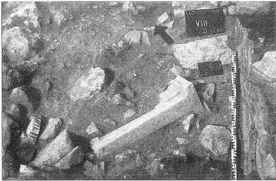
Fig. 2 - The stone specialist's workshop (by Cornus l.1, p. 44, fig. 27).

The belief that the area was used for this function came from the presence inside of stone material including pieces of rough stone, mostly architectural elements 3 , roughly hewn 4 , others reused 5 , and others still ready to be used 6 . There are various types of items found: there are funeral elements such as sarcophagi, fragments of religious furnishings (candelabrum and relative columns) 7 and architectural items (columns, capitals...) 8 . Some similar