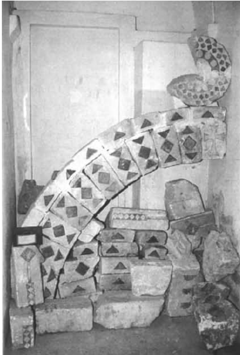
Fig. 5 - Architectural elements in limestone with red trachyte geometric inlaid pieces (from Spanu 1998, p. 103).

Lastly, some sculpted decoration elements including a capitals-impot, the shelves with an acanthus leaf, a capital with fish, a roughly hewn shelf in the body of a statue and a capital-impot that keeps the decoration of the item it was made from on its long side 16 .