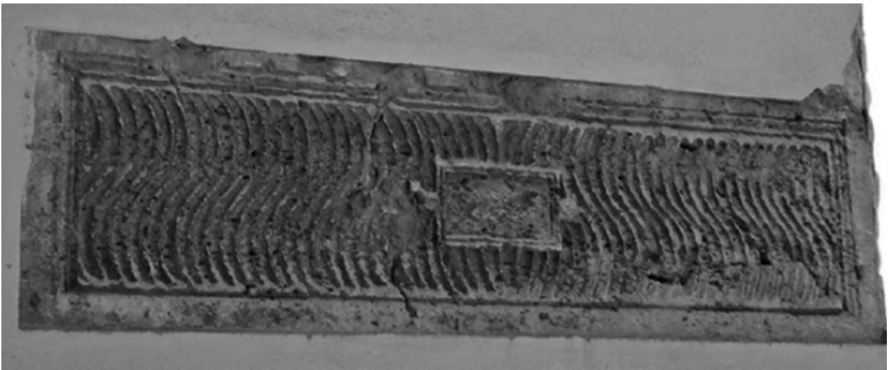
Fig. 3 - Cagliari, church of San Lucifero: strigil sarcophagus in limestone with tabula with handle (from TEATINI 2008, p. 1310, fig. 9).

These formal elements are of African work, perhaps from Carthaginian marble experts due to the decoration only on the main facade (figs. 4-5).