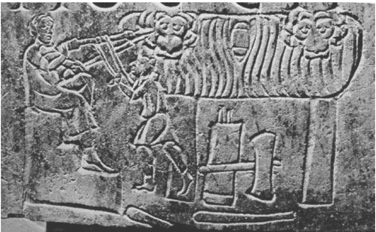
Fig. 5 - Detail of the Eutropos slab, portraying the shop of a marble worker (From BARATTA 2007, p. 212, fig. 28).