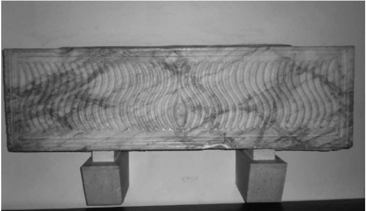
Fig. 2 - Pula, Parish Church of S. Giovanni Battista: strigil sarcophagus in marble (from TEATINI 2008, p. 1307, fig. 6).