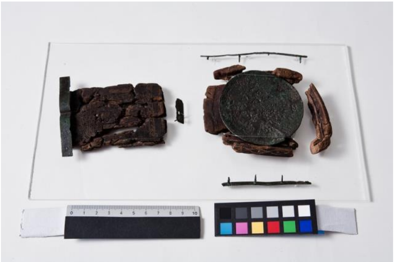
Fig. 1 - Cork case and bronze mirror.