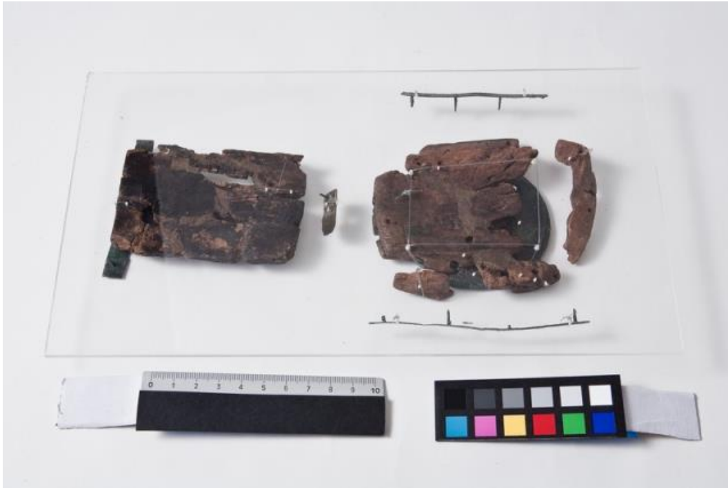
Fig. 2 - Cork case and bronze mirror.

The item has a bronze disc with a reflecting concave face without decoration (fig. 3); it is a “box type” used from the Etruscan Age.