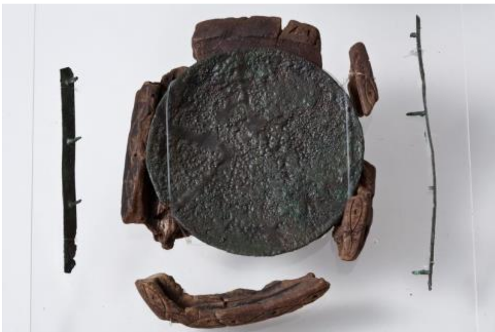
Fig. 3 - Bronze mirror.

The item has a bronze disc with a reflecting concave face without decoration (fig. 3); it is a “box type” used from the Etruscan Age.