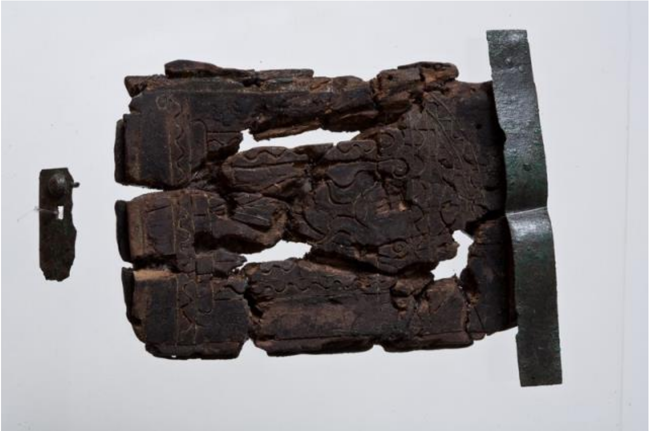
Fig. 4 - Cork cover with decoration.

The upper part of the case must have been sliding, through bronze hinges fixed to the sides and thin nails in the upper margin (fig. 4). The cover fragments show the decoration made with a thin silver thread inserted in the engraved cork.