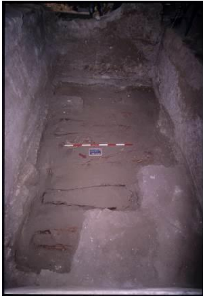
Fig. 3 - Map of burials in the crypt (by Martorelli, Mureddu 2002a, p. 50, fig. 27).

The types of tombs used included ground burials in the initial phase of use of the crypt 4 , followed by placement in wooden coffins of a trapezoidal shape (fig. 4). At times, the bodies of the dead were found placed on the covers of previous coffins, collected in a shroud and covered in a layer of lime. In other cases, the buried bodies occupied the space free between two coffins, to exploit the remaining spaces to the maximum 5 .