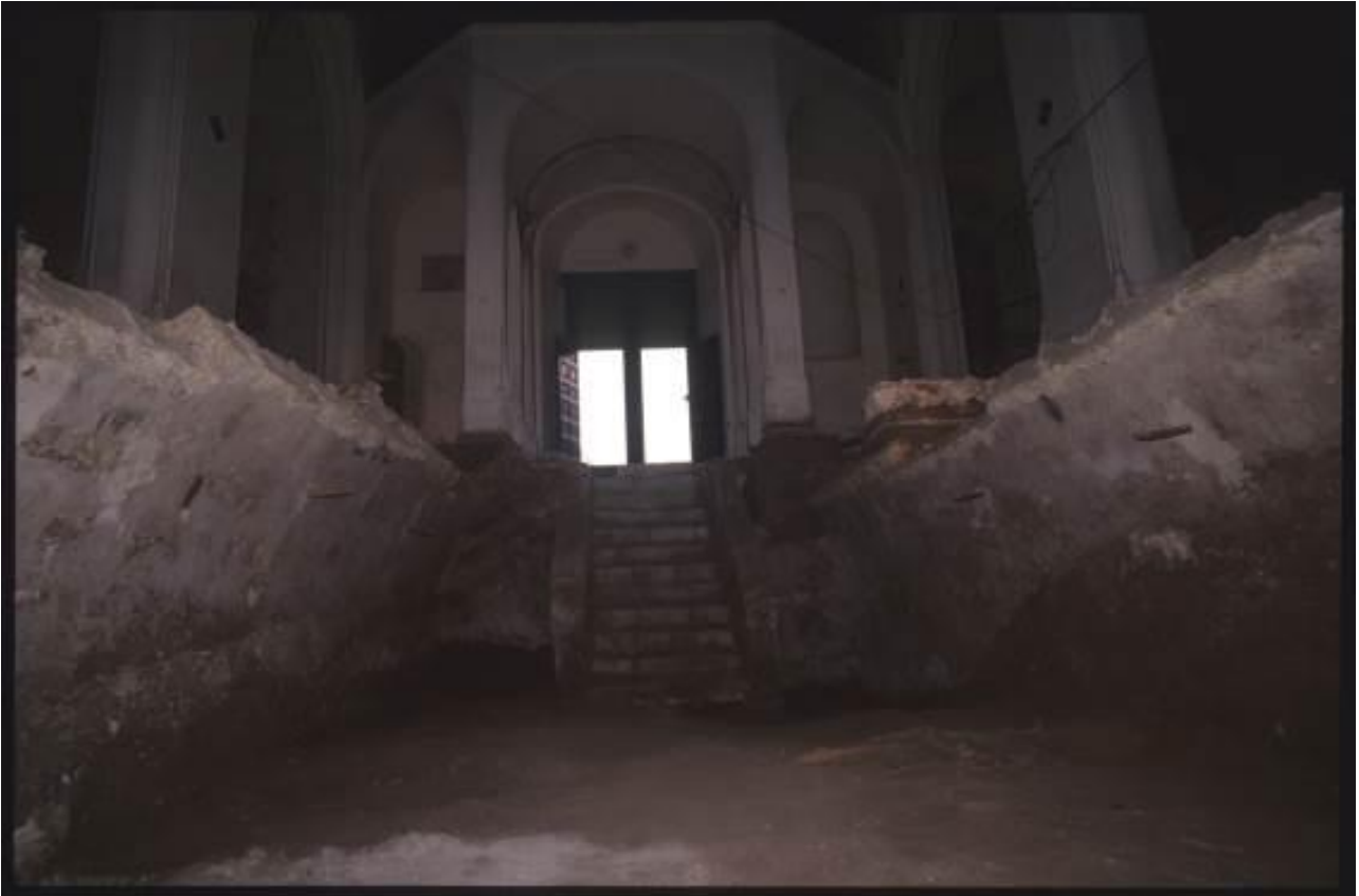
Fig. 1 - Central crypt when the dig took place in the church. The crypt ceiling appears to be vaulted.

Between the XVII and the start of the XVIII century 1 the largest crypt of the seven found in the area was implanted below the central nave of the church of Sant'Eulalia (figs. 1-2) 2 .