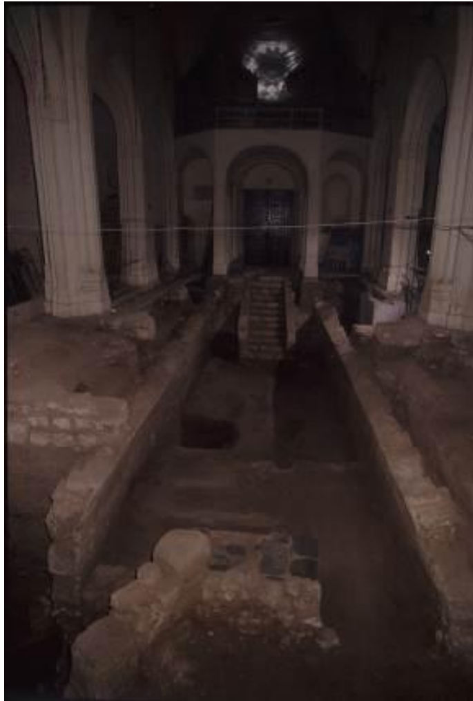
Fig. 2 - Next digging stage in the church: the main crypt reveals the presence of an altar in andesite slabs and the stairs connecting it to the church above.

A staircase connects the church to the crypt: the 12 remaining steps (knocked down during the dig for static reasons) were to the West and led to a rectangular environment (about 13.50 x 4.80m) initially barrel-vaulted; in its south-east area there was an altar 1.8 x 0.8 metres, covered in slate slabs. 3 Under the non-preserved floor, about a hundred of graves were proof of the use of the crypt for burials: they were on different levels, arranged to exploit all the space available (fig. 3).