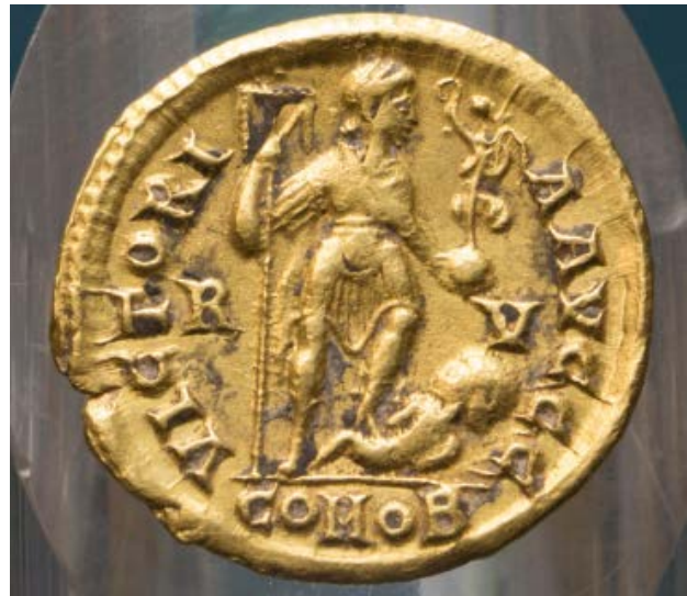
Figs. 1, 2 - Gold coin of Honorius: front (1) and back (2), (photo by Unicity S.p.A.).