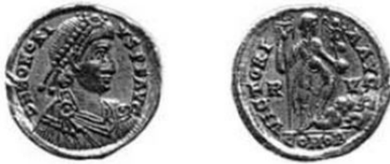
Fig. 3 - Solid gold coin from Honorius I, minted in Ravenna (from RIC X, tab. 40, n. 1321).

The portrayal of the bust of Honorius with his typical hairstyle where his hair is held by a double rows of pearls and his dress (perhaps a paludamentum ) is held by a circular buckle with four pendants (fig. 1). The iconograph of the emperor can be compared with a bronze coin found in Cornus, in the burial area of Columbaris (fig. 4) 1 .