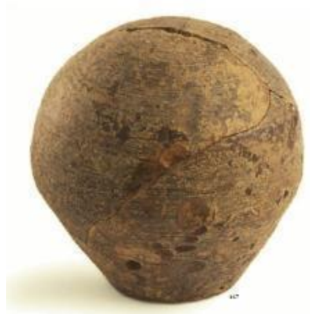
Fig. 4 - Money box from a silos in the Cathedral of Sassari, 14th century. (from MARTORELLI). 2007, fig. 147, p. 85).