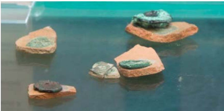
Fig. 1 - Coins oxidised on money box fragments.

Amongst the materials and layers of silt filling the bell-shaped cistern, whose mouth opens in the Opus signinum of the portico of the Sant'Eulalia late antiquity district, we found some common pottery fragments with some bronze coins oxidised on the inner surface, so abraded that the two sides could not be read so no dating was possible. (fig. 1).