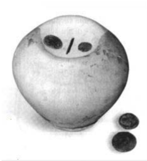
Fig. 3 - Imperial period example from the Archaeological Museum of Ptuj – Slovenia ( http://badwila.net/pottery/salvadanai/index.html ).

cannot be generalised to allow a hypothesis about their use by different social classes, both in private and publicly, both in reference to daily life and in holy life.