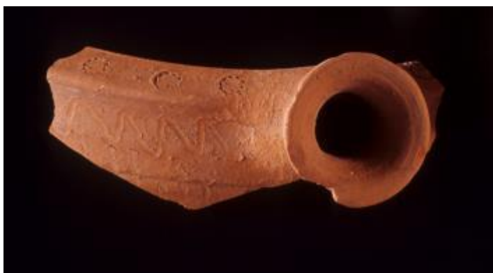
Fig. 2 - Common pottery with Polite wave patterns and punched circular patterns : casseroles with spout