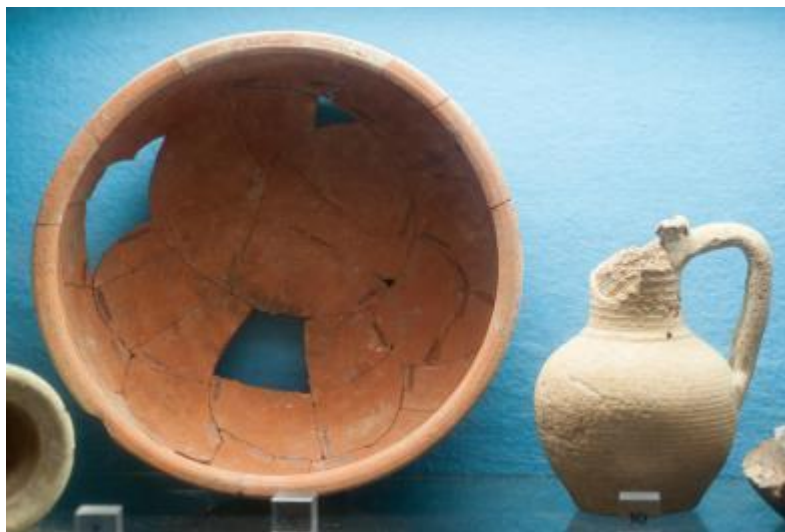
Fig. 4 - Display detail: Byzantine bowl and single-handled pitcher

The ceramic items inside the sewers can be attributed to a time period mainly from the 4th to 7th centuries A.D. The materials were found in the mud that did not flow out due to a stone blockage that had blocked the outflow and allowed archaeologists to outline the life of this part of the quarter from the 4th century A.D. Up to at least the end of the 7th century, terminus post quem of the use of the underground infrastructure. This latter date would seem to be the highest of the entire site 10 .