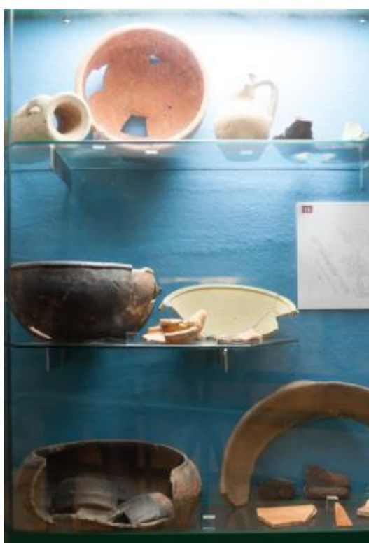
Fig. 3 - Materials from the sewer displayed

Some of the most characteristic items are a spatheion (fig. 3, top left), a Byzantine ribbed pitcher 6 (fig. 4) and a paleo-Christian oil lamp (fig. 3). Some of the above ceramic productions (African kitchenware, Sigillata D, spatheion ) show the strong trading times between Sardinia and Africa, in particular the spatheion (IV-VII century A.D.) made in