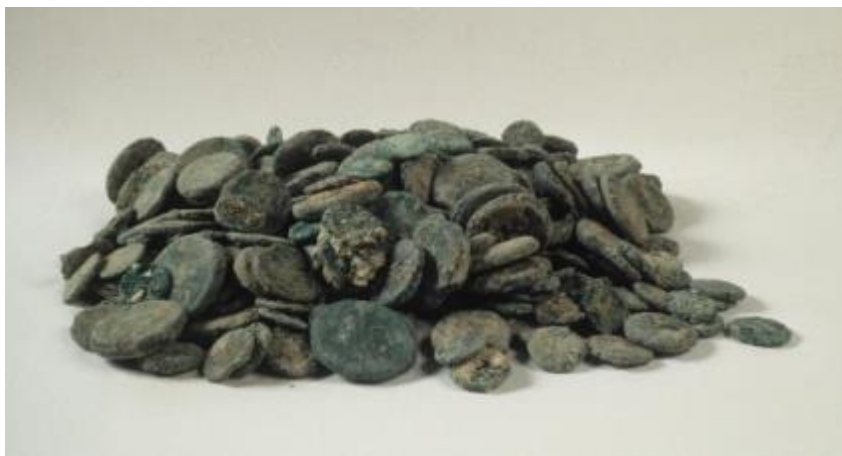
Fig. 2 - Coins of the thesaurus (photo by AFS).