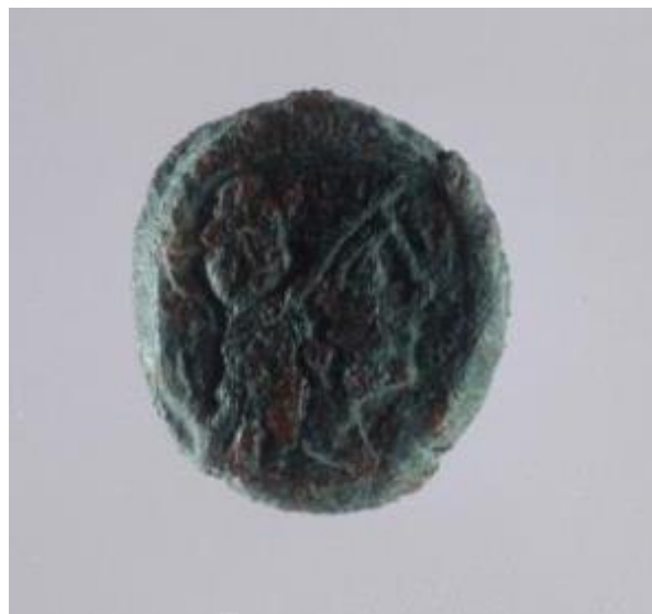
Fig. 4 - Coin found in the thesaurus : recto (photo by AFS).