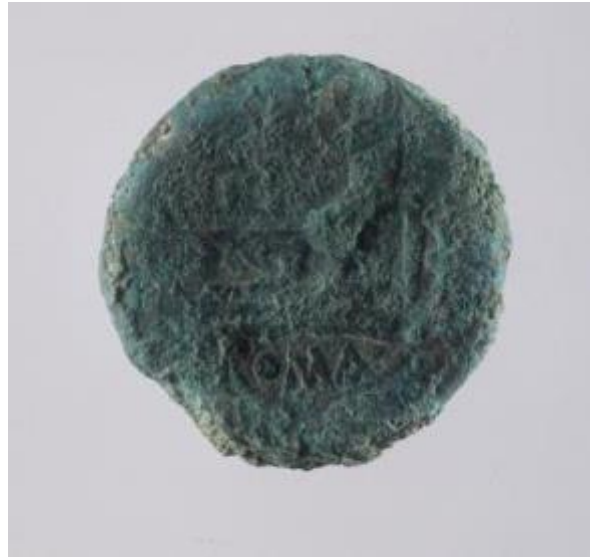
Fig. 3 - Coin found in the thesaurus : reverse.

The bronze items show the continuous use of a sanctuary for several centuries, to which the thesaurus also belonged. From a preliminary study on the first renovated coins, it was possible to identify some semi-axes dated between the 3 rd and 2 nd centuries B.C. 2 ; while they are also proof of the Roman domination - in 238 B.C. - some coins, which show the word ROMA on the exergum, hypothesised as the production mint (figs. 3-4).