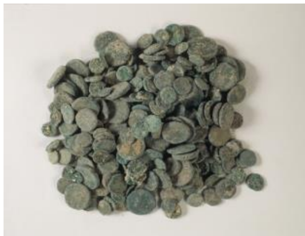
Fig. 1 - 307 coins found in the thesaurus.

Inside the thesaurus well found in the Northwest area of Sant'Eulalia, 307 bronze coins (figs. 1-2) were found, that can be dated between the 3rd century B.C. and the end of the 1st century B.C., or respectively from the Late Punic Age to the beginning of the rule of Augustus 1 .