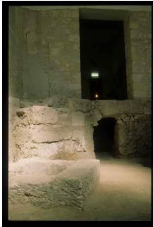
Fig. 1 - The first discovery: well ring and XVII century wall structures beyond the sacristy.

The interest for the church and its building in medieval times can be found in some publications preceding the great underlying discoveries: in the 60s of last century, Maria Freddi developed a reading of the ancient church's structures starting from the recovery of some archive documents where it was first mentioned 2 . The work of 2000 by Maria Bonaria Urban highlighted the dedication to the martyr of Merida 3 , patron saint of Barcelona from the XIII century, who in Cagliari perhaps replaced the primitive dedication to Santa Maria della Vittoria dei Catalani, wanted by the Aragonese king after the conquest 4 . Finding the underground archaeological area was as lucky as it was surprising. In 1990, in order to create a Treasury-Museum to make the Parish heritage accessible, works were started to renovate the sacristy premises which were in a poor condition. The damp that had formed in walls indicated the presence of a well and led to the extraordinary finds hidden under the floor. The first structures to surface were the shaft of the well raised in