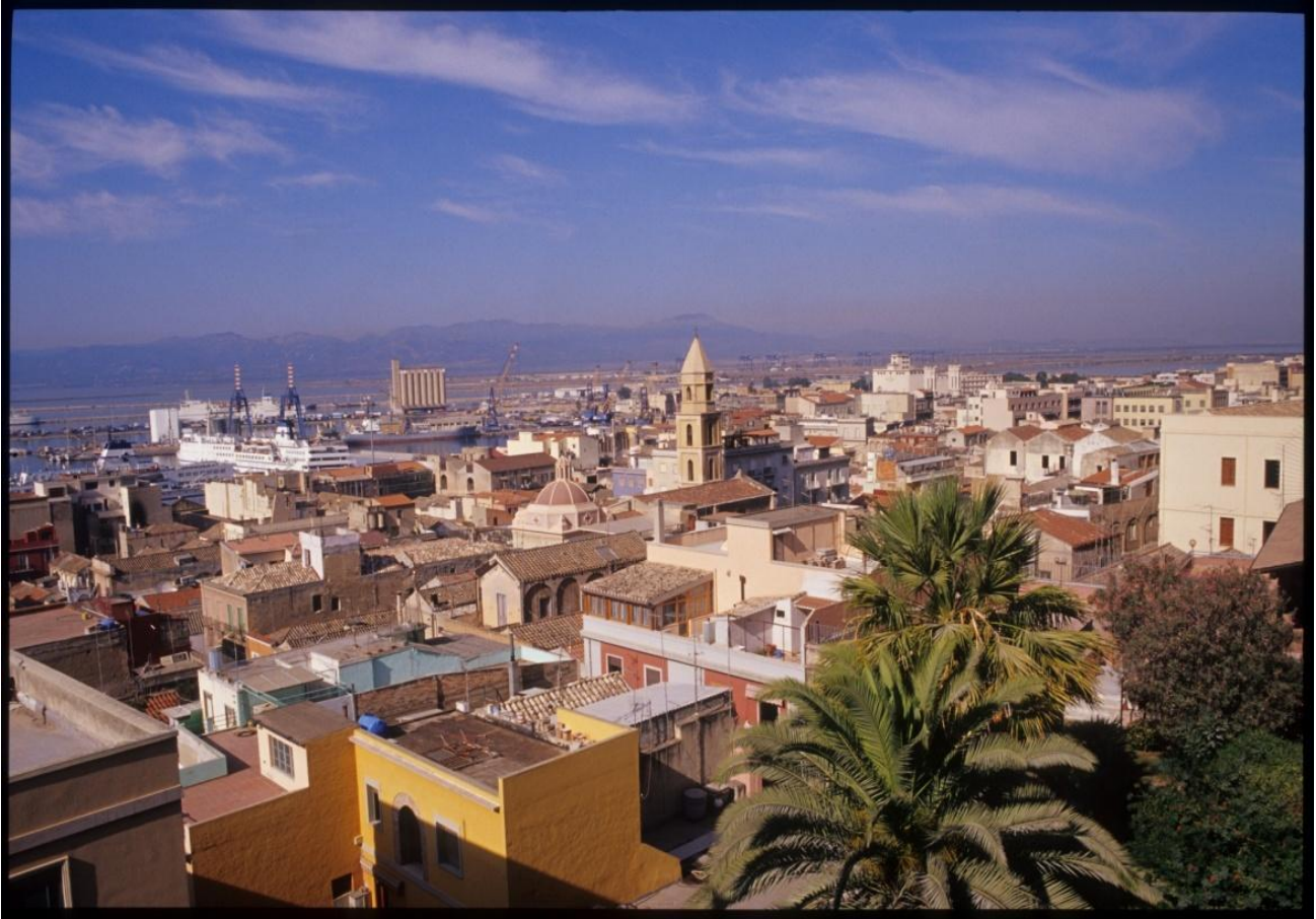
Fig. 4 - View of the Marina district, showing the belltower of Sant'Eulalia.

with regard to the Marina district (fig. 4), the various finds have highlighted the stages related to abandon of the area which probably occurred after the end of the VII century B.C. In that stage, the site became progressively covered by earth and the layers deposited taken an irregular shape until they form a hill which definitely covered the area 22 .