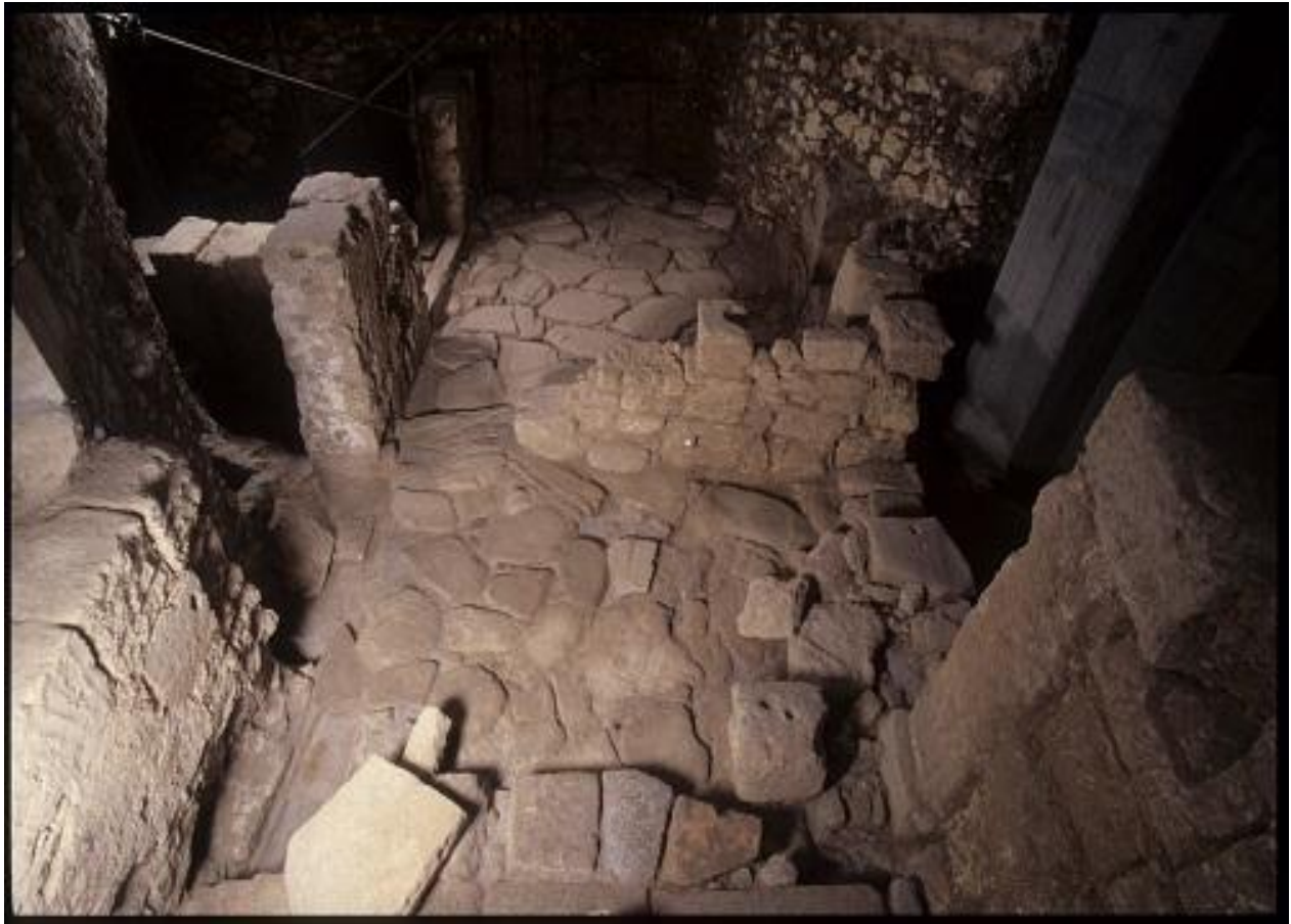
Fig. 2 - Paved road and some portions of masonry revealing the different construction stages.

The first data emerging from the 1990 and 1999 archaeological surveys was presented in an event-convention dedicated to it in 2000 and was then merged into a monograph by R. Martorelli and D. Mureddu, Cagliari, le radici di Marina , in 2002 7 . That same year the authors published an article in the the XXIX volume of the magazine Archeologia Medievale , on the results arising from a selection of items found on the house with threshold, overlooking the paved road 8 .