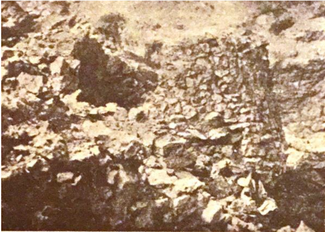
Fig. 2 - Nuragic village of Tiscali (from TARAMELLI 1933, fig. 4, p. 443).