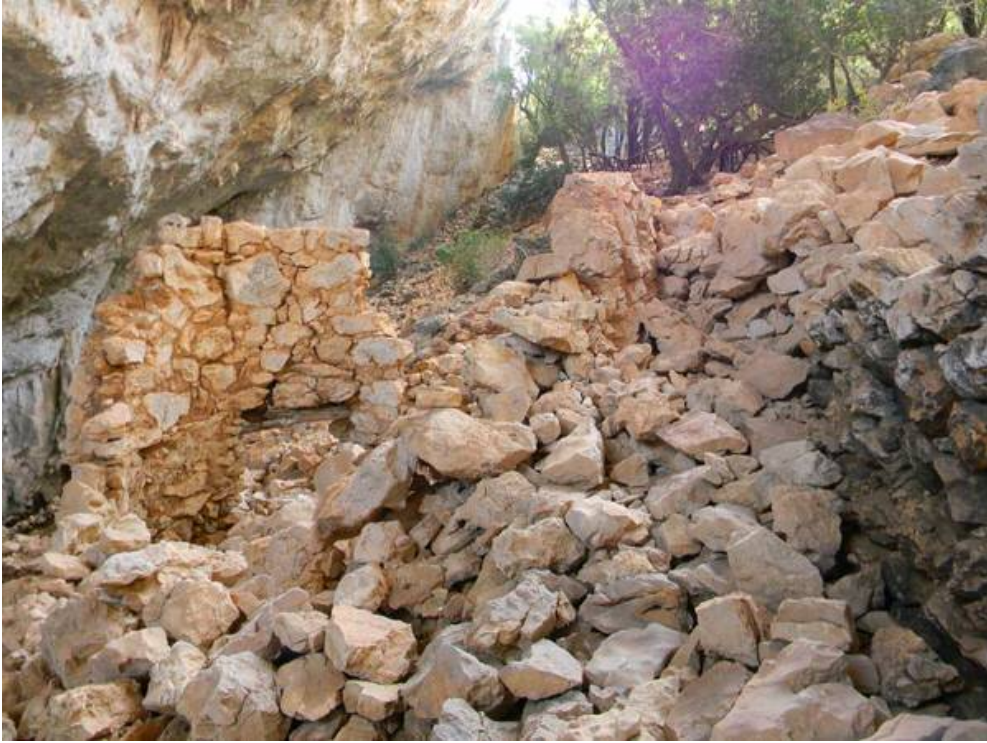
Fig. 3 - Collapsed structures in the village of Tiscali.