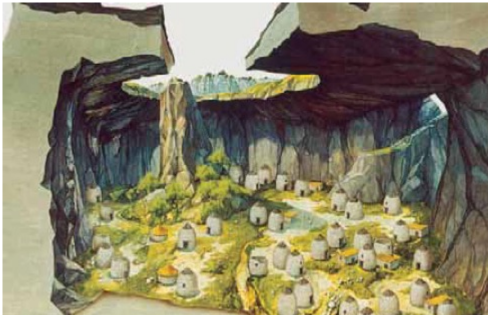
Fig. 5 - Hypothetical reconstruction of the sinkhole of Tiscali (from MORAVETTI 2005, fig. 89, p. 104).

In general, the archaeological evidence allows us to interpret it as a civil settlement, consisting of housing facilities, warehouses, fencing for animals, etc., related to the exploitation of the agricultural-pastoral area (Lanaittu Valley, the plateaus and neighbouring clearings) built in a location which was naturally sheltered and protected both from bad weather and summer heat (fig. 5).