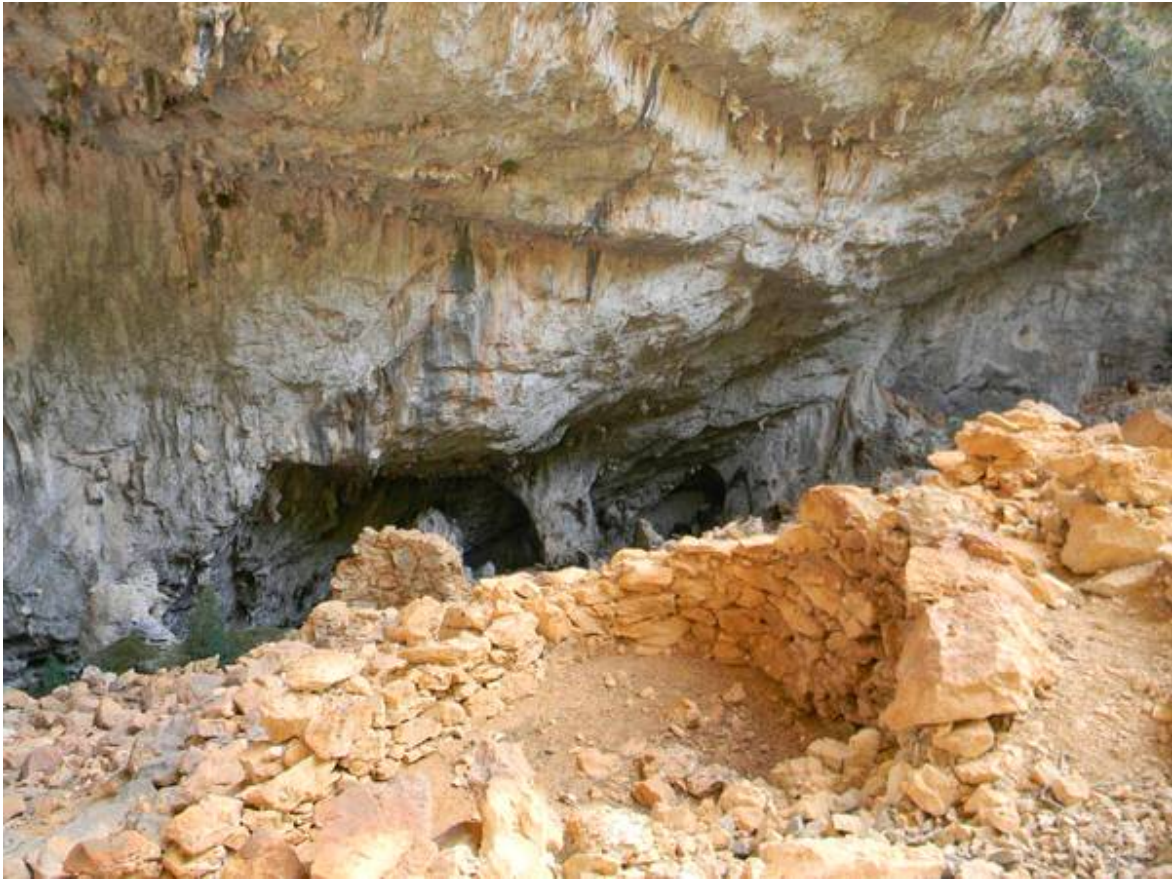
Fig. 2 - Detail of the village of Tiscali.

The first settlement was formed by about forty huts and is in the north sector of the hollow. The second is on the southwest side and comprises about thirty houses. The rooms, most of which have collapsed, are rectangular, square, circular or sub-elliptical. The walls are thin, often built using roughly-hewn local limestone and mortar made from a mix of clay and gravel, with the addition of organic inert matter, and adjusted by filling the holes between one stone and the next with the mortar; the mortar was smoothed on the outside by following the direction of the walls. There were often niches and holes in the internal walls. Some structures were of a truncated-conical shape with jutting walls, originally probably covered by a conical roof made of branches. One of these structures has a wooden architraved entrance (fig. 4).