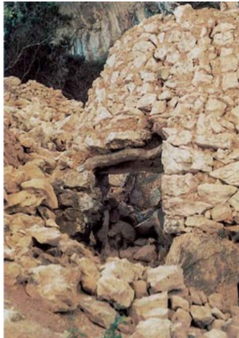
Fig. 4 - Hut with a wooden lintel entrance in the village of Tiscali (from MORAVETTI 2005, fig. 87, p. 102).