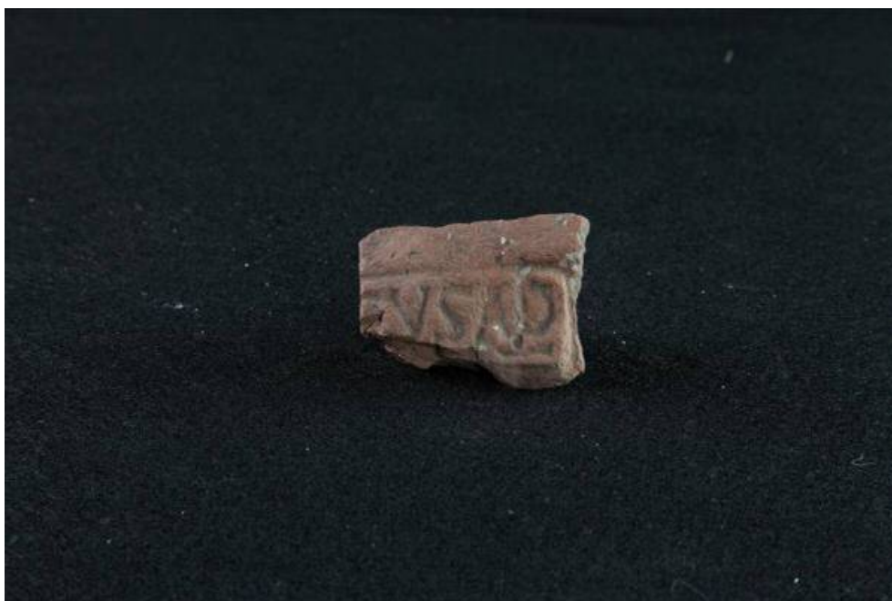
Fig. 2 - Fragment of a flat tile with stamp imprinted on a rectangular cartouche [EVSAP] found in the giants' tomb of Thomes-Dorgali (photo by Unicity S.p.A.).

Some of the oldest items found, near the exedra, include a fragment of a wall of colourless pitcher (fig. 3), that carries a trace of a graffiti inscription that can be traced to the IV-III century B.C. (Republican Age).