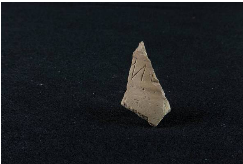
Fig. 3 - Wall fragment of a small achromatic jug with an engraved Latin inscription from Thomes-Dorgali.

Some of the oldest items found, near the exedra, include a fragment of a wall of colourless pitcher (fig. 3), that carries a trace of a graffiti inscription that can be traced to the IV-III century B.C. (Republican Age).