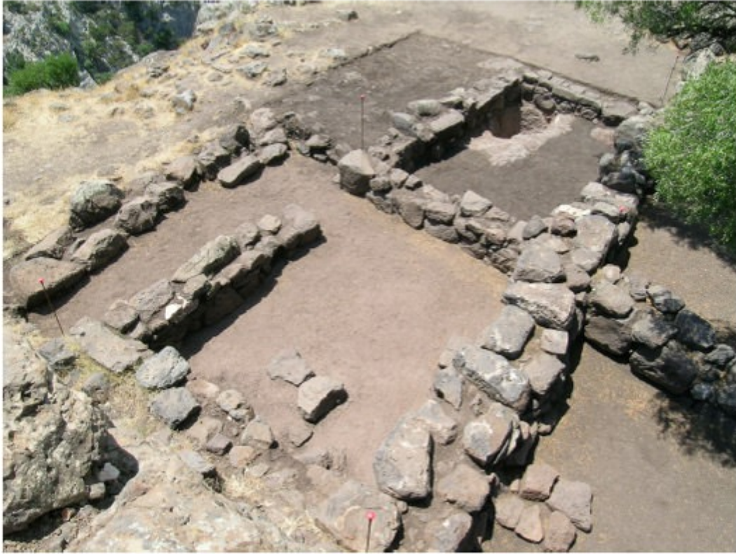
Fig. 4 - Roman buildings, area 3000 of Nuraghe Mannu (from DELUSSU 2009, fig. 4, p. 3).

Daily life during Roman times is documented by abundant ceramic fragments, metal artefacts, coins and animal remains. The site moreover documents a further historic phase: Byzantine and early Medieval Age from the IV-VI century B.C.