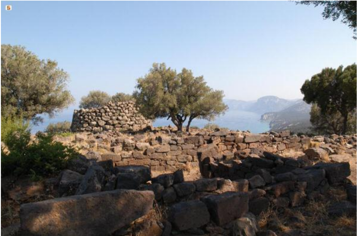
Fig. 3 - Nuraghe Mannu-Dorgali (from http://www.sardegna.digitallibrary.it/mmt/1920/412295.jpg ).

The Roman Age settlement (fig. 4), dating from the Republican Age and the late Imperial Age (2nd century B.C. - 6th century AD), there are still two-room homes built with isodomic walls, often reused, and with semi-worked stones, dry-walled, covered with tile roofs and supported by single or double pitched wooden beams.