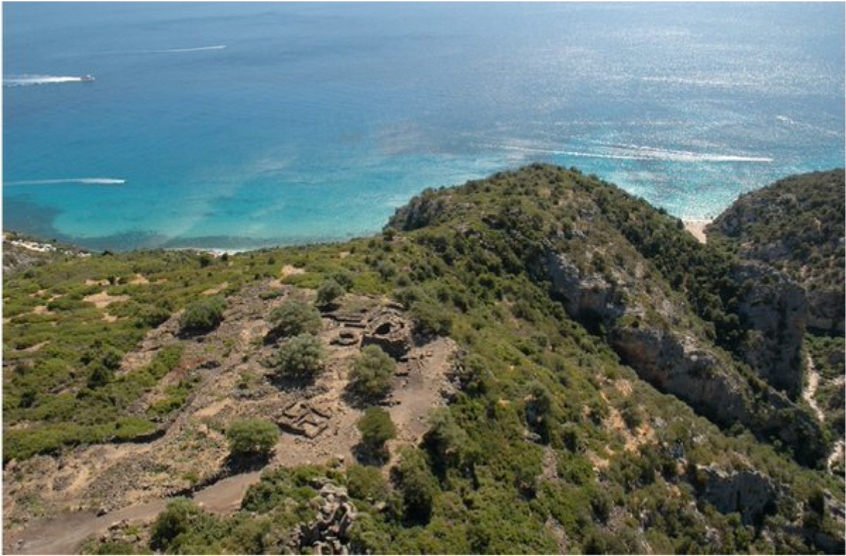
Fig. 2 - Nuraghe Mannu-Dorgali (from DELUSSU 2009, fig. 1, p. 1).

The archaeological area includes a simple nuraghe surrounded by a large Nuragic and Roman settlement, connected with terracing (fig. 2).