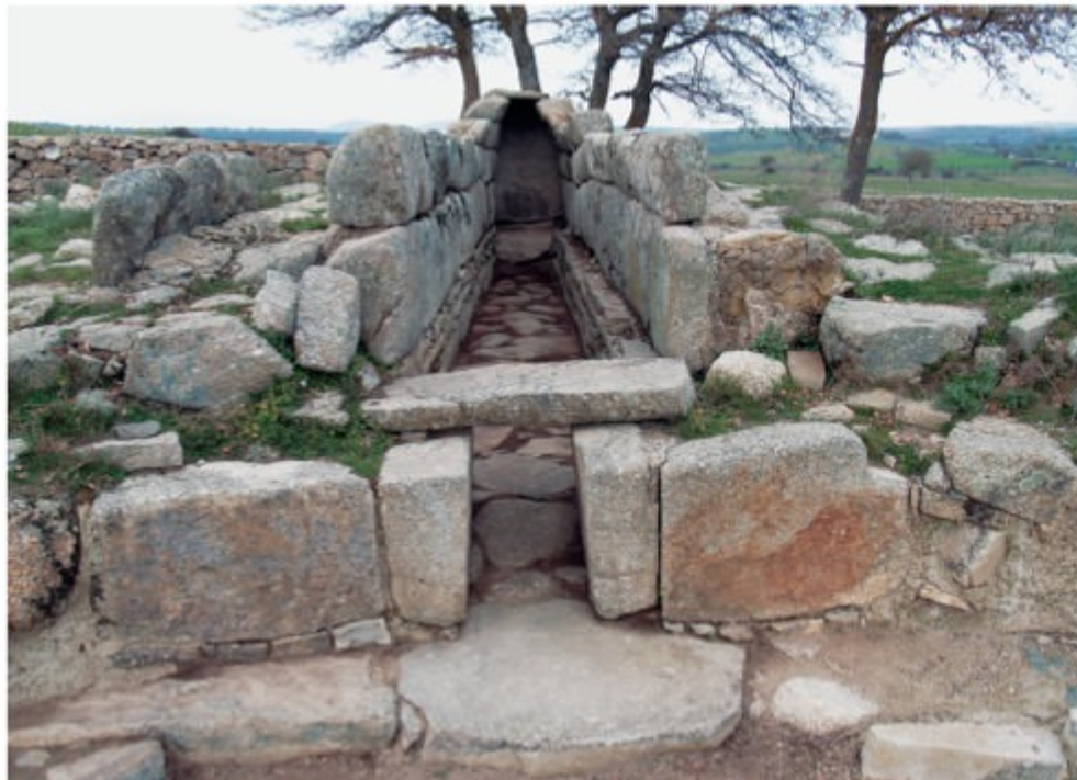
Figs. 3, 4 - Giants tombs II-III of Madau-Fonni (from MORAVETTI 2014, pp. 58-59).