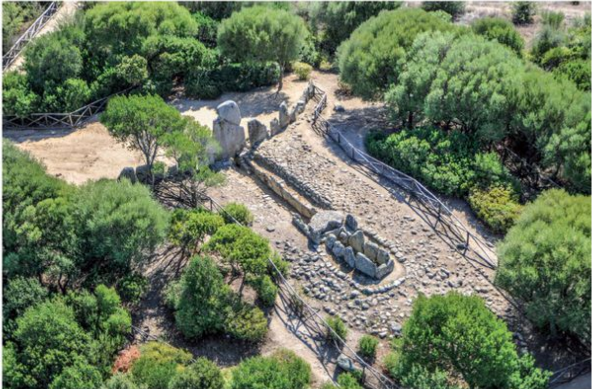
Fig. 2 - Giants' tomb of Li Lolghi-Arzachena (from MORAVETTI 2014, p.53).

surround a ceremonial area called exedra. The monument has its maximum height at the centre of the exedra and this gradually decreases both toward the ends of its apse. In central-northern Sardinia, during the Middle Bronze Age II (1400-1300 B.C.), another type of tomb, in addition to the orthostat tombs with arched stelae (fig. 2) appeared, built with an isodomic or polygonal block technique, without stelae, and with an entrance mounted by an architrave (figs. 3-4).