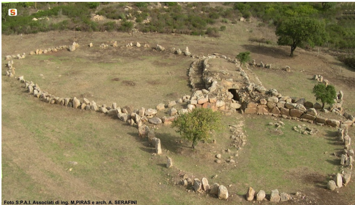
Fig. 4 - Giants' tomb of San Cosimo-Gonnosfanadiga