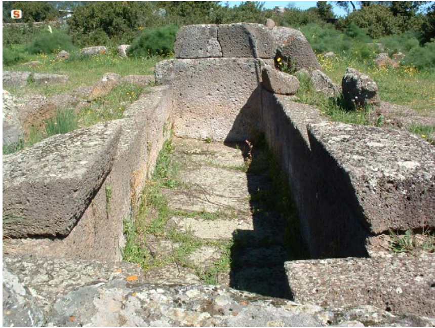
Fig. 3 - Giants' tomb of Iloi 2-Sedilo

(from http://www.sardegna.digitallibrary.it/index.php?xsl=615&s=17&v=9&c=4461&id=211113 ).