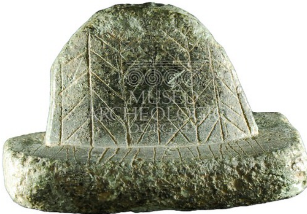
Fig. 1 - Smoothing tool

A steatite smoothing tool was found in the 1930s by Antonio Taramelli in the small Nuragic village of Isportana, the ruins of which are on the south-east outskirts of Dorgali, together with pottery fragments, frame weights and glass paste pieces of necklaces.