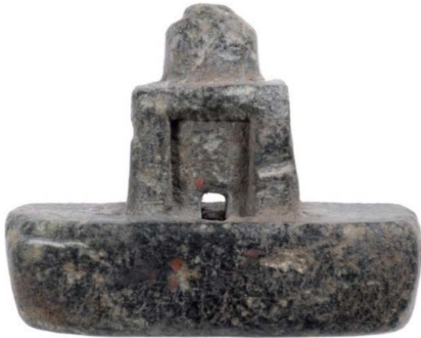
Fig. 4 - Smoothing tool representing a four-lobe Nuraghe from Nuraghe Santu Antine of Torralba (from CASTIA 2014, p. 271).