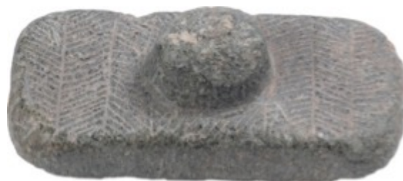
Fig. 3 - Smoothing tool from Nuraghe Santu Antine of Torralba (from CASTIA 2014, p. 270).

The category of smoothing tools can be included in the items commonly used for working hides and pottery; they are often decorated with engraved "herringbone" motifs (fig. 3) and supplied with a simple grip, sometimes made in the shape of a small nuraghe (fig. 4).