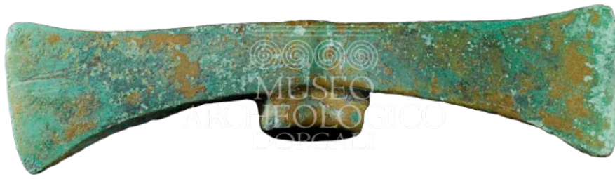
Fig. 3 - Double bronze axe from Serra Orrios-Dorgali (from http://www.museoarcheologicodorgali.it/wp/museo_archeologia_in_sardegna/la-storia-di-dorgali-in-20-reperti/ ).

As part of the Nuragic metallurgical production, double axes belong to a category of artefacts influenced by Cyprus and found in Sardinia, intact or incomplete, in various settlements and in Nuragic closets. They are built on the principle of having a cutting edge on both sides, with a central handle. They are divided according to the type of blade in massive double axes, heeled double axes and parallel blades, and double axes with orthogonal bites 1 (figs. 4, 5).