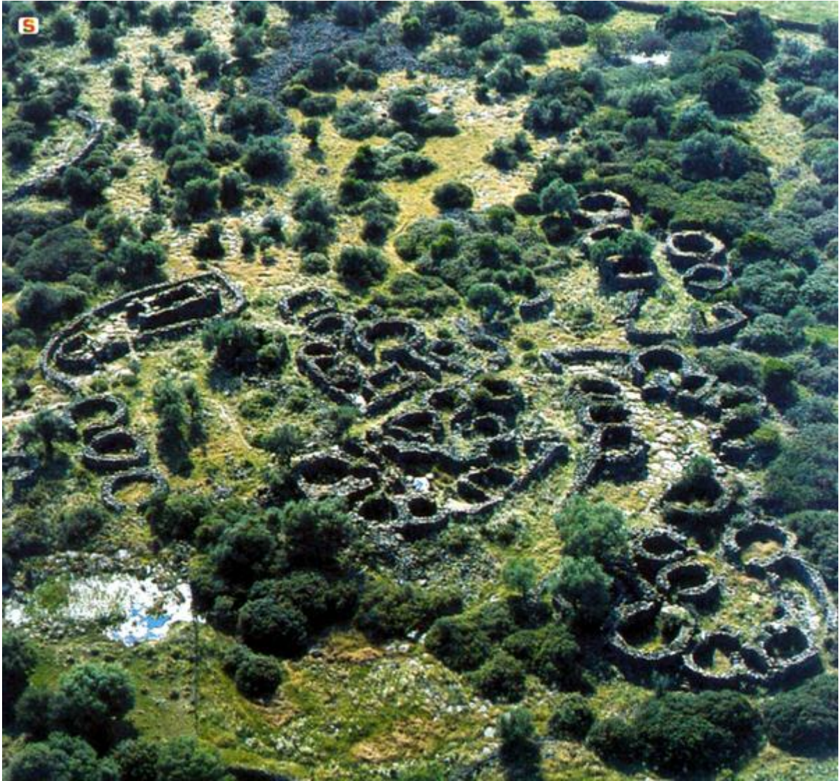
Fig. 1 - View from above of the Nuragic village of Serra Orrios-Dorgali (from http://www.sardegna.digitallibrary.it/index.php?xsl=615&s=17&v=9&c=4461&id=102911 ).

A double axe (fig. 3) and a bronze alloy tool used for working wood come from the Nuragic village of Serra Orrios, in the area of Dorgali (figs. 1, 2).