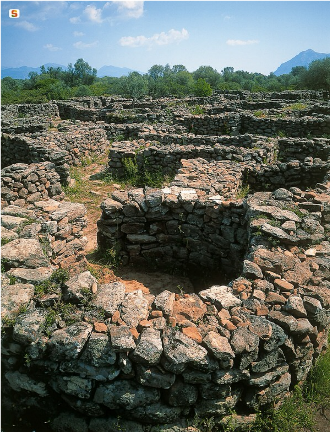
Fig. 2 - Detail of the huts of the village of Serra Orrios-Dorgali.