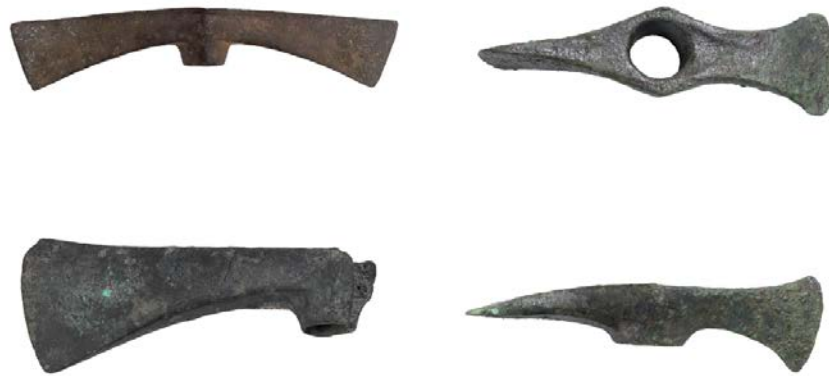
Fig. 5 - Double axes found in Sardinian Nuragic contexts (from DEIANA 2014 p. 293).

The dual axe of Serra Orrios, with parallel blades and a neck, with a flat upper surface, a semi-circular lower side, two parallel jutting blades at the sides of the handle jutting out of the round neck, diagonal to the axis of the tool, parallel to the blade, where the wooden handle was inserted. This is a style completely unknown outside Sardinia, that can be interpreted as a local Nuragic reworking of prototypes from the East. It was created by using a simple stone mould with a half-shell (mono valve) in a single block with the hollow shape of the axe, and where the molten metal was poured into.