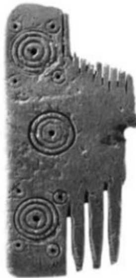
Fig. 4 - Bone comb from Santa Filitica (from ROVINA, GARAU, MAMELI, WILKENS, fig. 13.7, p. 264).