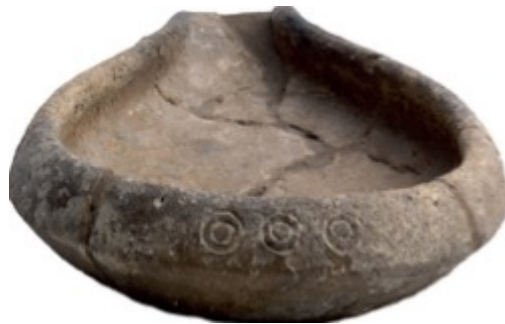
Fig. 3 - Heart-shaped oil lamp from the Su Nuraxi-Barumini Nuraghic complex dated to the IX-VIII centuries BC decorated with circled "fiery eyes" (from BAGELLA 2014, p. 261).