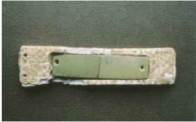
Fig. 2 - Brassard (plaque for an archer's arm guard) with bone housing decorated with "fiery eyes", from Domus XIII in the underground necropolis of Anghelu Ruju-Alghero (from LILLIU 1999, fig. 173, p. 141).