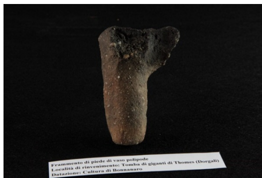
Fig. 1 - Foot of a multi-foot vase from Thomes-Dorgali (photo by Unicity S.p.A).

There is only one cylindrical shaped foot left of the vessel (dimensions: 10.3 cm height; max. 3.7 cm), with straight ends, and a piece of the joint to which the unidentifiable body was attached (figs. 1-2).