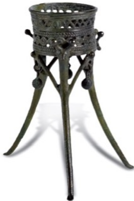
Fig. 5 - Miniature tripod from the Cave of Pirosu-Su Benatzu in Santadi.

In Nuragic civilisation, in the Final Bronze Age phase (12th-9th century B.C.) There are some small tripod supports on votive bronze statues, used in Cypriot tradition (fig. 5).