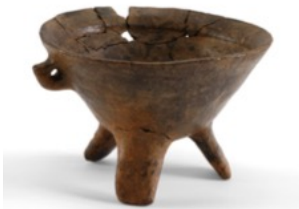
Fig. 4 - Early Bronze tripod vase with elbow-shaped handle with axe-shaped elongation from the Is Carillus Cave of Teulada/Santadi (from MANUNZA 2014, fig. 1, p. 58).