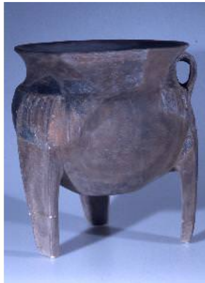
Fig. 3 - Tripod vase from the Monte Claro Culture exhibited at the National Museum G. Sanna of Sassari from Su Crocifissu Mannu-Porto Torres.

Tripod pots correspond to a ceramic type of various dimensions which allows cooking food in direct contact with fire. In different shapes, they were common throughout almost all prehistoric Sardinian cultures, from the Neolithic Age up until the Middle Bronze Age (figs. 3, 4).