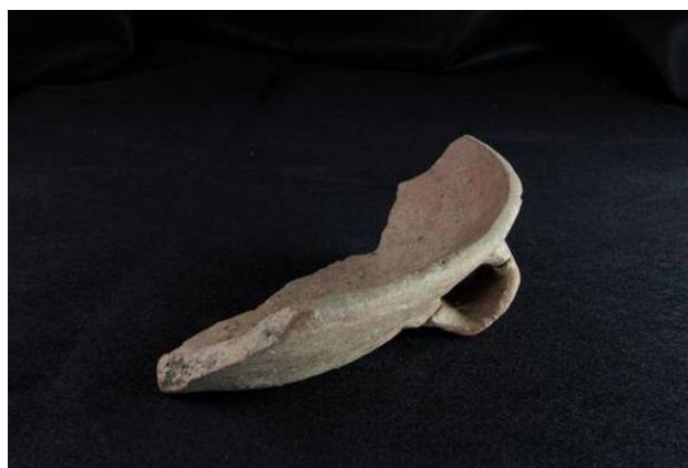
Figs. 1, 2 - Fragment of pan from the Giants' tomb of Thomes-Dorgali.