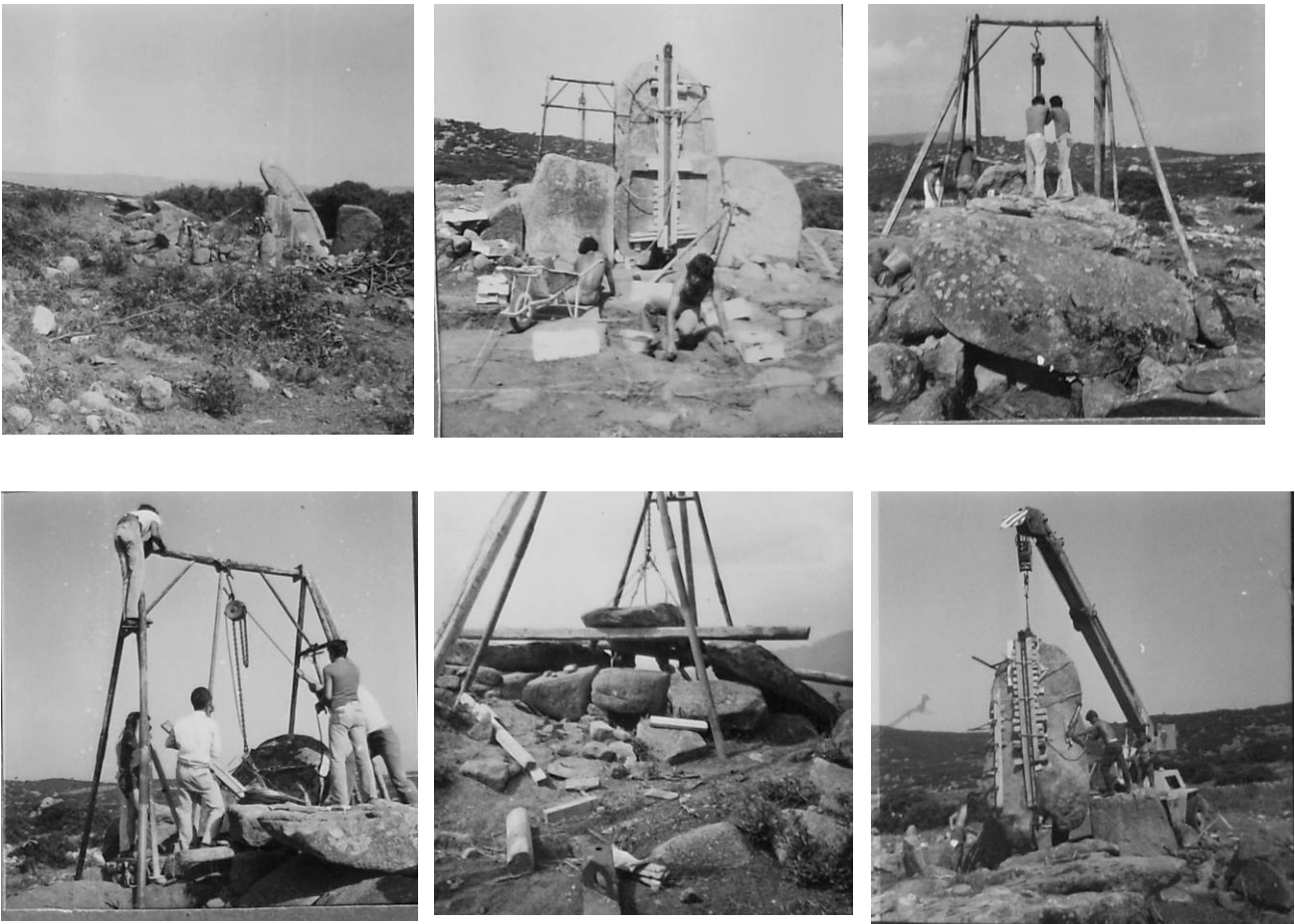
Figs. 3-8 - A series of images of the 1977 archaeological intervention at the Giants' tomb of Thomes-Dorgali

Before the intervention, the tampering of the tomb was quite obvious: the orthostats of the façade were uneven and the stele appeared strongly inclined. The burial corridor, partly uncovered and without some of the cover slabs which had been moved from their original location, had repeatedly been the subject of illegal excavations. The restoration works allowed recovering almost the entire structure (straightening of the stele, realignment of the orthostats of the exedra, partial reconstruction of the interior wall of the funeral corridor and rearrangement of its cover), built in local granite, and verifying the technical expedients used for its construction. The excavation, which affected the exedra, the burial chamber and the stone plinth on which the barrow stood, yielded a rather simple stratigraphic sequence, marked by a substantial tampering of the original situation especially in the exedra and the chamber.