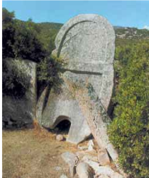
Fig. 2 - The Giants' tomb of Thomes before the excavation and restoration work (By Moravetti 1998, fig. 22, p. 30).

During the summer of 1977 (fig. 2) it was investigated and restored under the Scientific Direction of Francesco Nicosia, then Superintendent of the Archaeological Heritage for the provinces of Sassari and Nuoro.