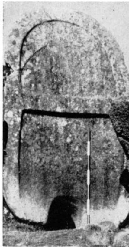
Fig. 1 - Arched stele of the Giants' tomb of Thomes (from Lilliu 1970, fig. 26, page 116).

of Isalle, in the locality of S'Ena 'e Thomes, whose name recalls the underground spring water streams which flow nearby. The monument was certainly known at the beginning of the last century and was mentioned for the first time in 1967 by Giovanni Lilliu, the archaeologist who discovered the Nuraghic mansion of Barumini (fig. 1) about Rapporti architettonici sardo-maltesi e balearico-maltesi nel quadro dell'ipogeismo e del megalitismo 5 . Lilliu, writing about the unique and unusual double-element granite stele, with a door at the base which characterises the monument, supplies us with useful details regarding its substantial size: " 3.65 metres high, 2.10 metres wide (at one third of the height), 0.40 metres thick. It has a volume of 3.066 cubic metres and a weight of 7.051 tons. The door, on the outside, is 0.50 metres high and wide".