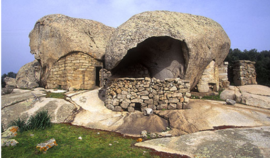
Fig. 2 - Tafoni in Pilastru, Arzachena.

Tafone homes are generally located on the hills, naturally protected by the cliffs; in some cases, they tower over the surrounding land forming natural strongholds which provide shelter, protection and defence. They may also be further strengthened and adapted by man by integrating a dry wall.