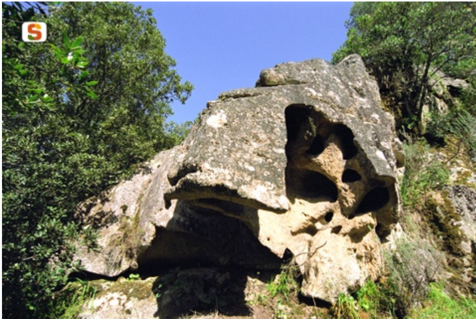
Fig. 1 - Limbara Nord, tafone of granite in Li Conchi (da http://www.sardegna.digitallibrary.it/mmt/480/528375.jpg )

Tafoni, a term of Corsican origin used to indicate natural cavities of granite due to erosion processes, are often found in walls and blocks, they can reach a considerable size and are a characteristic element of all the granitic landscape of Gallura (fig. 1).