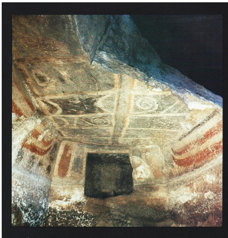
Fig. 3 - Painted tomb of the domus de janas necropolis of Mandra Antine in Thiesi (from Tanda 1985, fig. 30b, p. 151).

Paintings obtained through the use of ochre are also preserved on the walls of numerous domus de Janas of Sardinia (fig. 3).