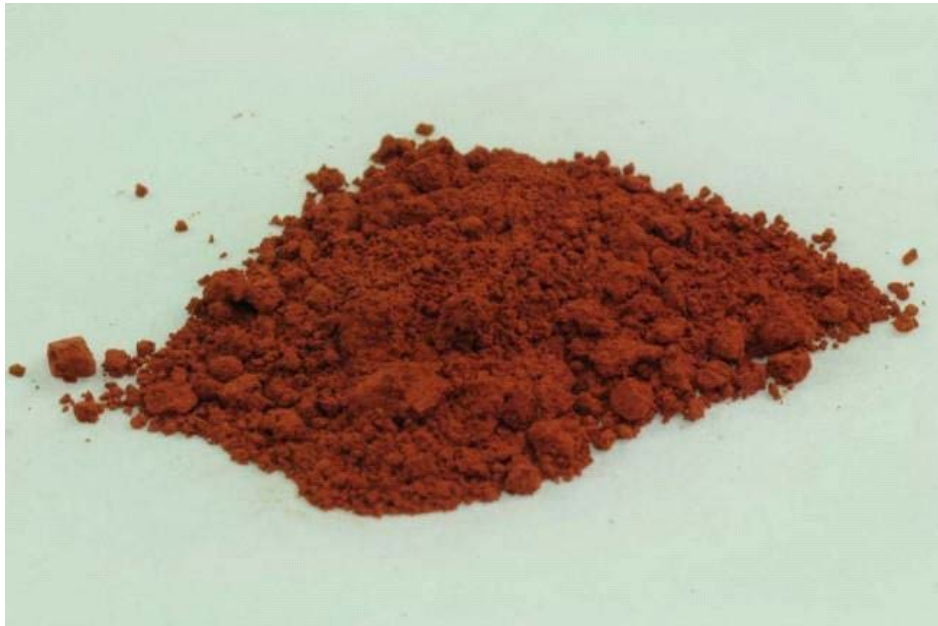
Fig. 1 - Red Ochre.

Ochre is an earth mineral (an earthy variety of Hematite) used for preparing dyeing substances (fig. 1).