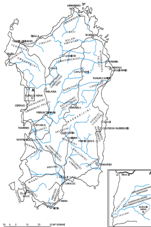
Fig. 3 – The populations of Roman Sardinia (from Mastino, Ruggeri 2005, p. 307).

The events of the territory of Arzachena during Roman times are not well known. The few elements of cultural material discovered to date have mostly been found in the most important Nuraghic sites. A ceramic fragment from Roman times was found in the heavy layer of collapse of room n in Nuraghe Albucciu. Ceramic fragments from Roman times have been reported in hut I and trenches A of the Nuraghic complex of La Prisgiona. In Malchittu, various prehistoric tombs have been surveyed in tafoni, subsequently re-used during the Roman phase. Sixteen copper ingots were recovered in 2001, still dating back to the period of Roman rule, about 20 metres deep in the territorial waters of Arzachena. The characteristics and quantity of the Roman artefacts would suggest that these objects refer to the local population's trade relations with Romanised society rather than to a phase of Roman attendance of the above mentioned Nuraghic sites.