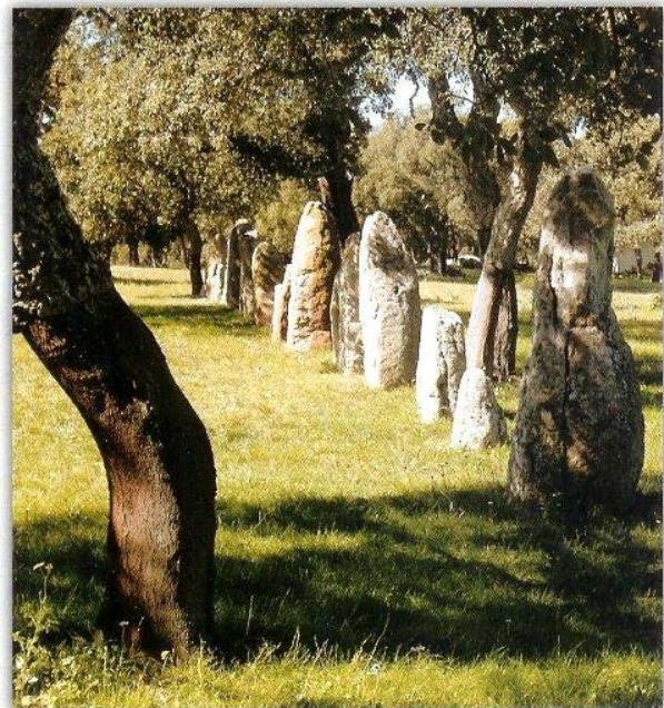
Figs. 1.2 - Monumental complex of Pranu Mutteddu in Goni (from http://www.pranumuttedu.com/images/principale.jpg ).

The concept of a domus de janas subterranean tomb, the typical funerary architecture of the Culture of Ozieri, does not exist in the necropolis of Li Muri in Gallura and throughout almost all Gallura.