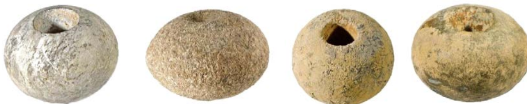
Figs. 4 - Arzachena, Necropolis of Li Muri, apple-shaped spheroids (from Antona 2013 pp. 82-83).

Even the artefacts typical of Culture of Ozieri, except for some apple-shaped spheroids in soapstone (fig. 4), cannot be compared with those found in the necropolis of Li Muri, although the materials decorated in the typical Ozieri syntax, from both residential and burial sites, have now well documented the spread of this culture even in Gallura.