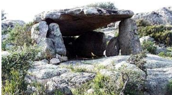
Fig. 3 - Dolmen of Ciuledda di Luras.

Even the artefacts typical of Culture of Ozieri, except for some apple-shaped spheroids in soapstone (fig. 4), cannot be compared with those found in the necropolis of Li Muri, although the materials decorated in the typical Ozieri syntax, from both residential and burial sites, have now well documented the spread of this culture even in Gallura.