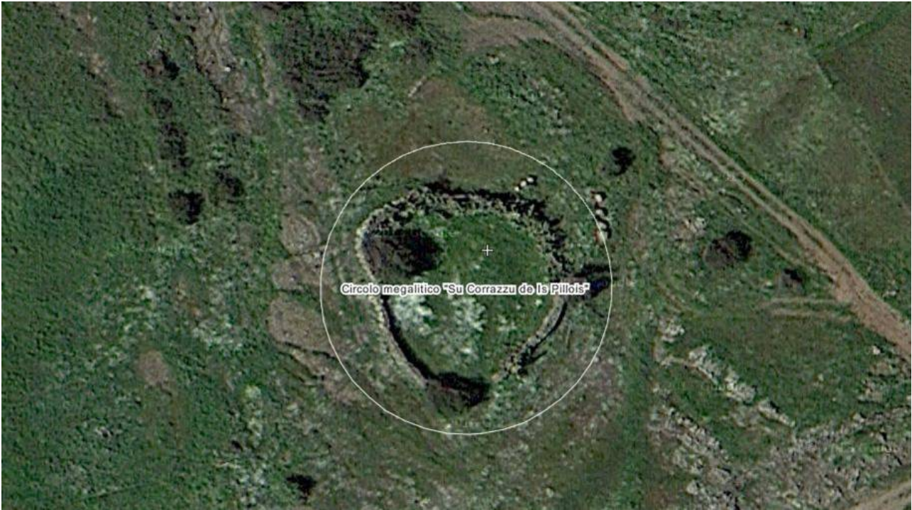
Fig. 3 - Megalithic circle Su Corrazzu de Is Pillois in Guspini

In Sardinia, within the articulated overview of prehistoric cultural phenomena in Gallura, there are a number of architectural funerary megalithic monuments, where the mound is an important component, which show a tight relationship with the Corsica-Pyrenean area (fig. 4).