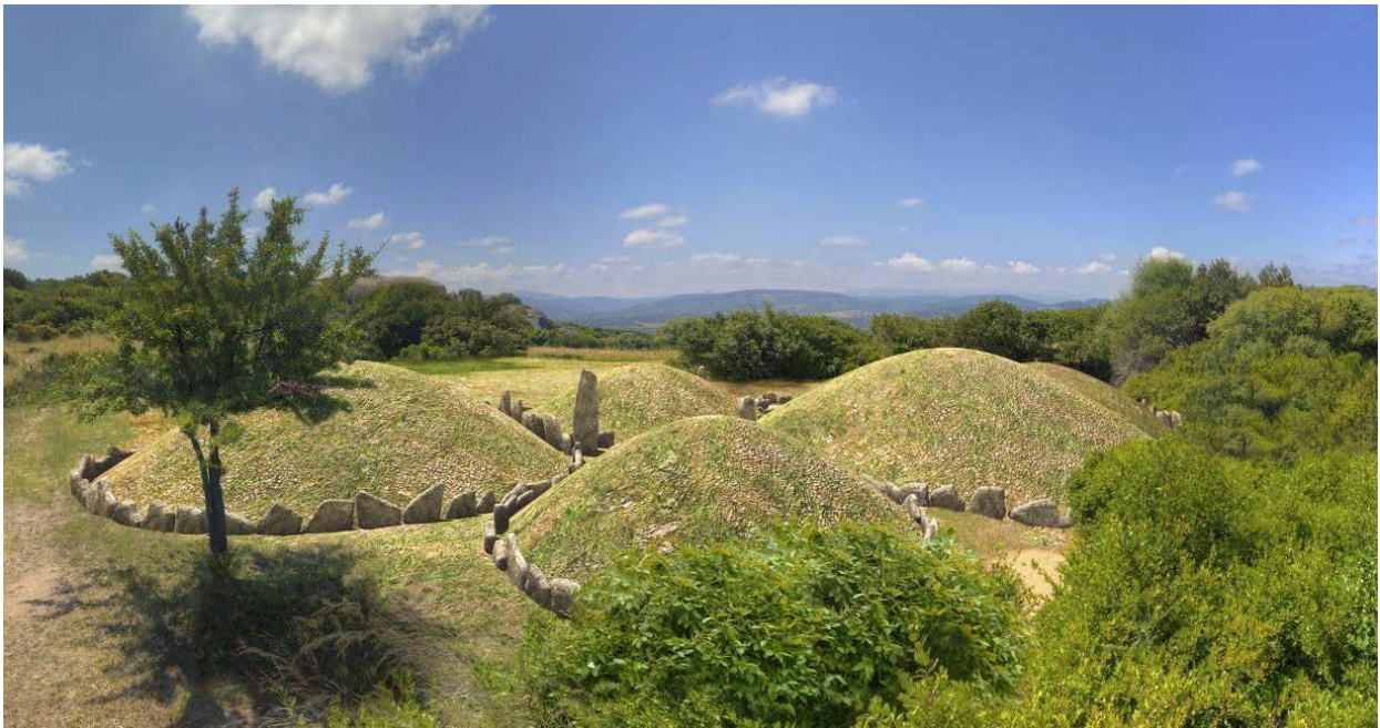
Fig. 1 - 3D reconstruction of funerary circles.

The necropolis of Li Muri is part of the so-called "European Megaliths". During the fifth millennium B.C. in Western Europe, specifically in the Catalan, Pyrenees and Corsica-Sardinia areas, there was a development of the cultural phenomenon of Megaliths, characterised by the use of large stones in cultural and funerary architecture, whose most distinguishing feature is the megalithic tomb within a circular mound (fig. 1).