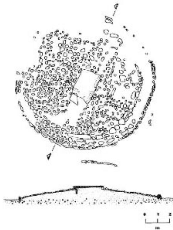
Fig. 2 - La Macciunitta (from Antona, Lo Schiavo, Perra 2011, p. 243, fig. 2)

The tombs in the Catalan, Pyrenees and Corsica-Sardinia areas have significant common structural features: the stone cista can be buried or visible, rectangular, square or trapezoidal, located inside a ring of stones consisting of small and medium size rubble or with a ring of single stones, with double-layer walls or large stone slabs positioned vertically of a diameter between 5.30 and 22 metres. The burials are generally single or multiple. The connection between the graves is of the tangent or intersecting type.