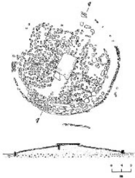
Fig. 2- Cista tomb with circular mound in La Macciunitta in Arzachena (from Antona, Lo Schiavo, Perra fig. 2 p. 243).