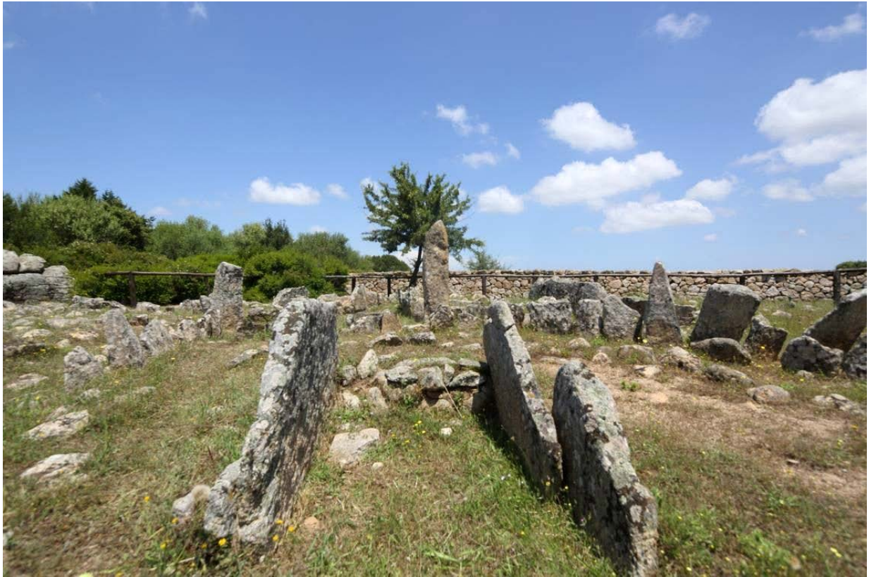
Fig. 2 - Arzachena, Necropolis of Li Muri, lithic cista of circle 2 (photo by Unicity S.p.A.).

The type of cover of the burial cistas of Li Muri is unknown, as they have always been found without any possible top slab. The same situation was discovered in comparable monuments in southern Corsica, similar to those of Gallura, a fact which has led some to hypothesise the original existence of a wooden cover.