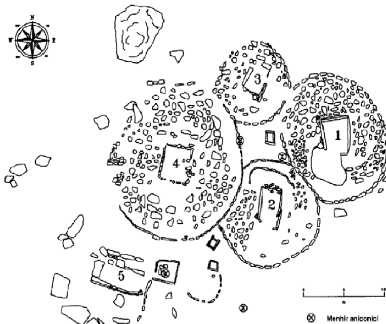
Fig. 1 Necropoli di Li Muri (Arzachena, SS). Planimetria.

During the fifth-fourth millennium B.C., at the same time as the custom of underground burials began, the custom of burying the dead inside a stone cista spread throughout Spain, France, Corsica and Sardinia. This aspect of megalithic burial is documented in the necropolis of Li Muri (fig. 1), and dates to Sardinian Late Neolithic Culture (3400-3200 B.C.); it is defined as early megalith age.