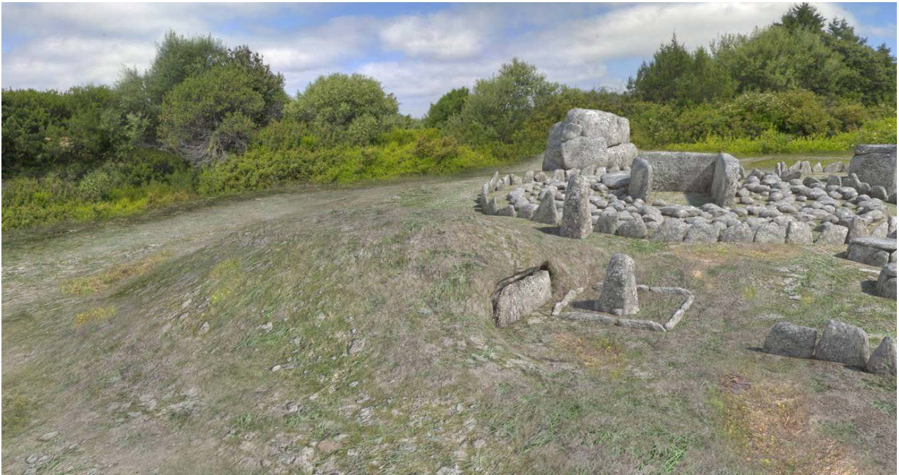
Fig. 4 - Rendering of the chamber tomb.

From a chronological point of view, in the absence of evidence allowing the identification of the time the tomb was built, the only guide fossil is a ceramic bowl with a flat bottom and walls curved inwards, recovered outside, which documents attendance of the monument during the Middle Bronze Age (1600-1300 B.C.).