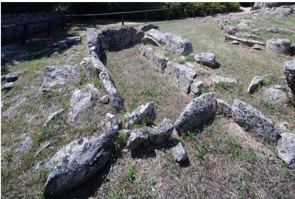
Figs. 2, 3 - Arzachena, Necropolis of Li Muri, tomb 5.

The structure of the mound does not develop on all sides, to the east it is free perhaps in order to facilitate the reuse of the burial chamber (fig. 4); this is a sign of social change