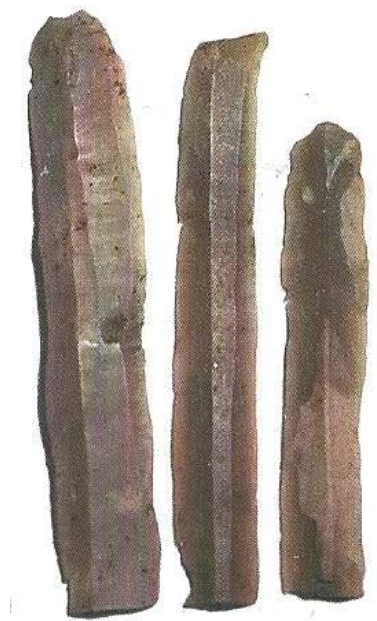
Fig. 1 - Flint blades from Li Muri in Arzachena (from Mancini 2011, p. 15).

The inhabitation of the Gallura area is evident from the Early Neolithic, as is proved by the traces near the coast concerning places and workshops for processing Sardinian obsidian and flint used in the production of weapons and utensils for daily use, connected to commercial traffic of these raw materials gravitating in the Western Mediterranean route through Corsica (fig. 1).