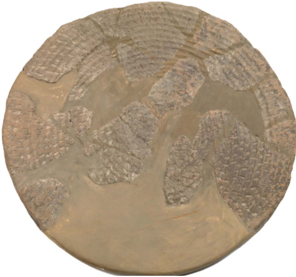
Fig. 4 - Rolling dish (from Fois 2014, p. 232).

The chronological reference lies between the fourteenth and twelfth centuries B.C. The artefact is exhibited at the National Archaeological Museum G.A. Sanna of Sassari.