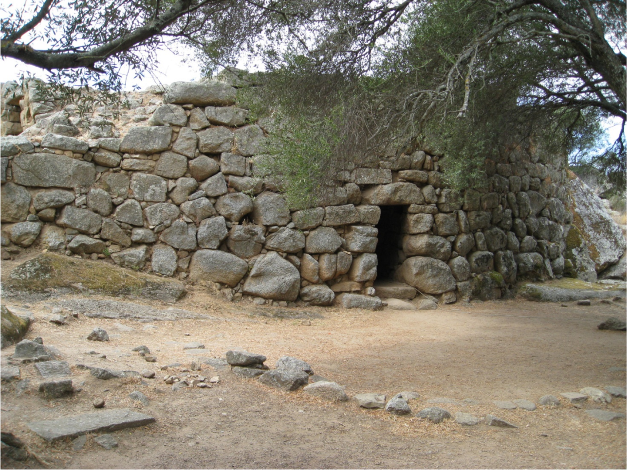
Fig. 2 - Nuraghe Albucciu, (from http://upload.wikimedia.org/wikipedia/commons/4/41/Nuraghe_Albucciu.jpg ).

It is a ceramic article used for baking focaccia bread. The partially reconstructed finding has a discoid shape; it is characterised by a slight central depression and a rounded rim (fig. 3).