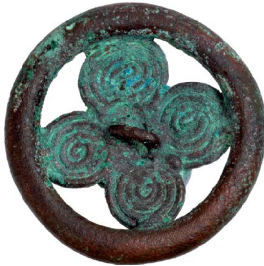
Fig. 3 - Pendant from Nuraghe Nurdole in Orani (from MORAVETTI A., ALBA L., FODDAI L. 2014, p. 280).