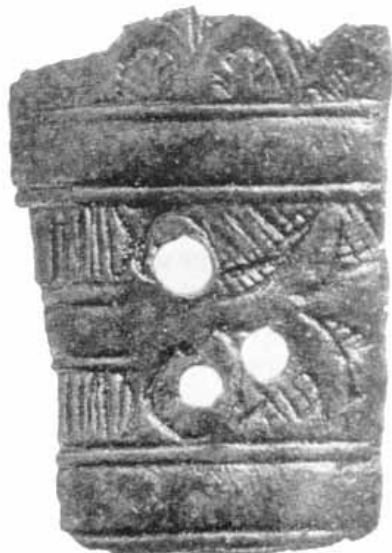
Fig. 3 - Nuraghe Albucciu: fragment of bronze situla (from ANTONA RUJU, FERRARESE CERUTI 1992, fig. 23).