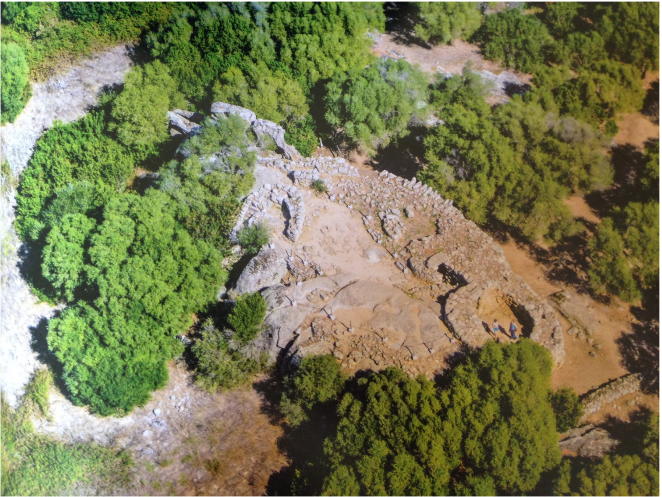
Fig. 2 - View from above of Nuraghe Albucciu (from ANTONA 2013, p. 97).