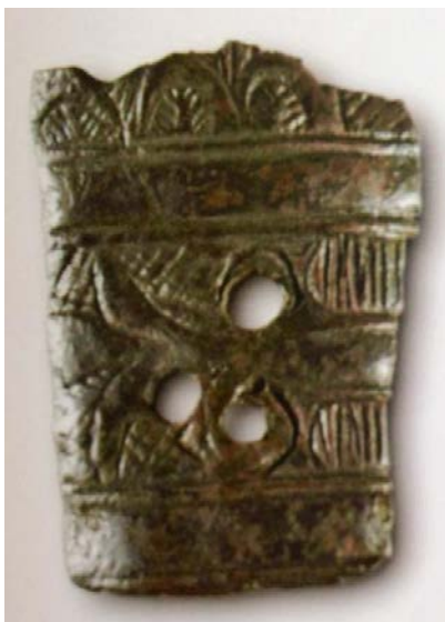
Fig. 4 - Detail of the bronze situla fragment (from ANTONA 2013, p. 103).