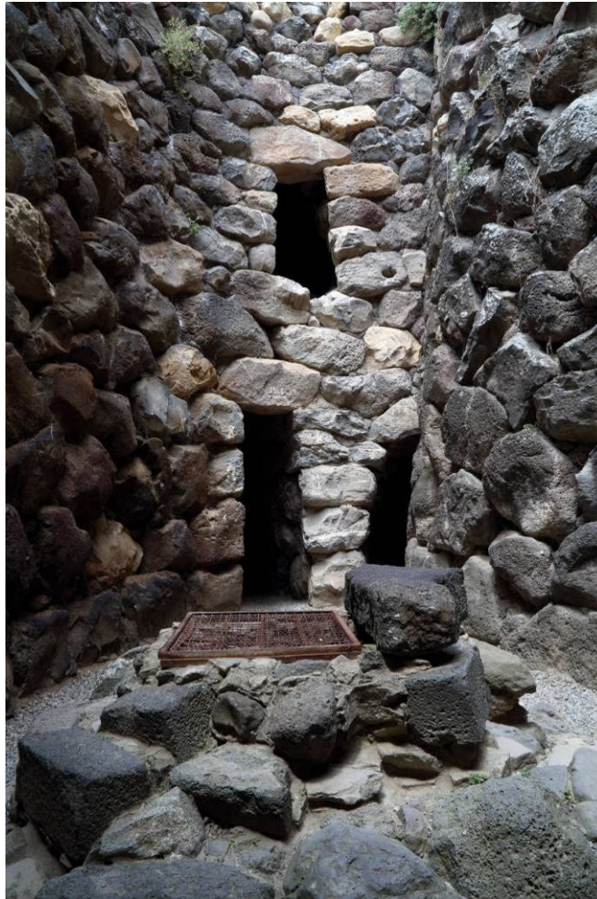
Fig. 3 - Detail of the courtyard where the entrance door to the chamber of tower D can be seen in the centre.