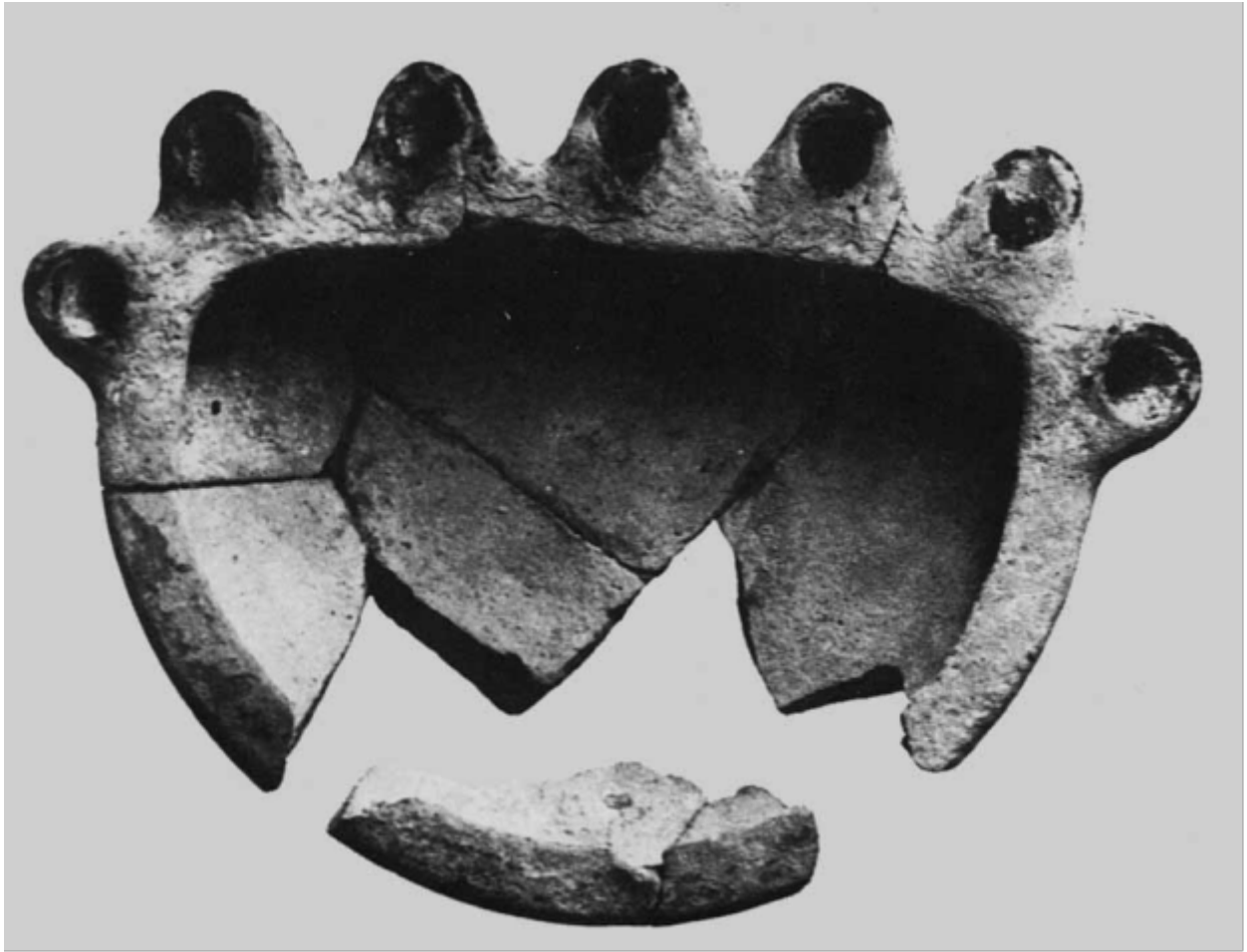
Fig. 2 - Silo of tower C: lamp with seven lips, "Hanouka" type, dated to the end of the 4th century B.C. (From Lilliu, Zucca 1988, fig. 36, p. 63).

Based on the type of items found a suggestion has been made that the material was the offloading of a part of the votive store of a sacellum, which functioned from the 4th to the 2nd/beginning of 1st century B.C., according to a custom of reusing items, widely found in Punic Sardinia.