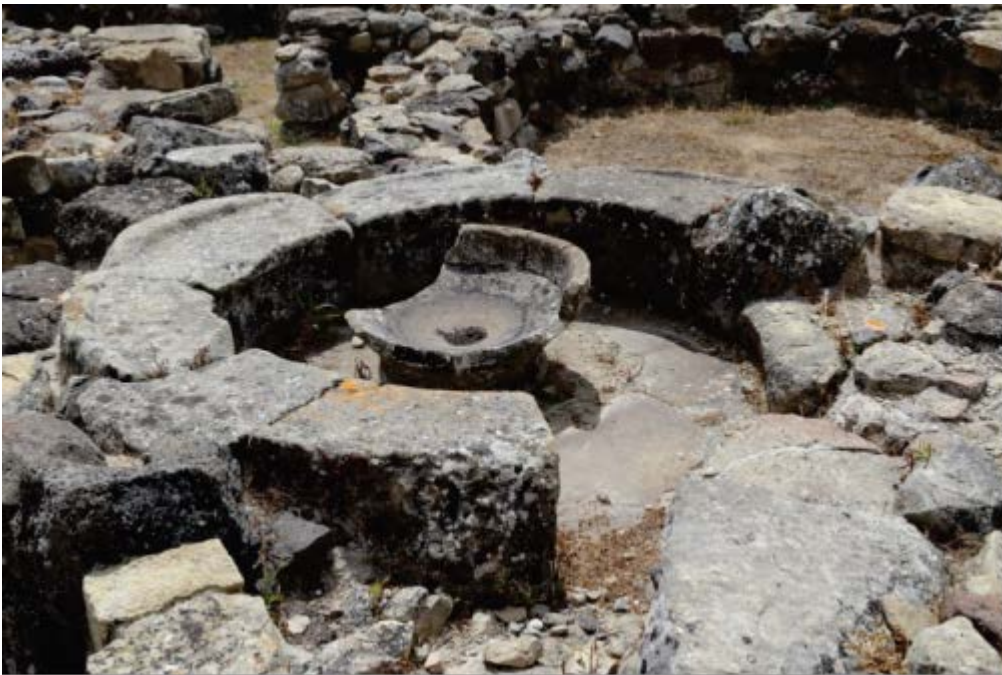
Fig. 1 - Archaeological area of Su Nuraxi, courtyard house 42, room 90 with bench and central basin.

Inside the set of rooms arranged in the form of an insula in the Nuragic village of Su Nuraxi (huts 51, 64, 65, 90, 175, 195, τ, and ππ), eight small circular rooms were discovered, that can be traced to the type named in archaeological literature as "rotonde con bacile" (figs. 1, 2).