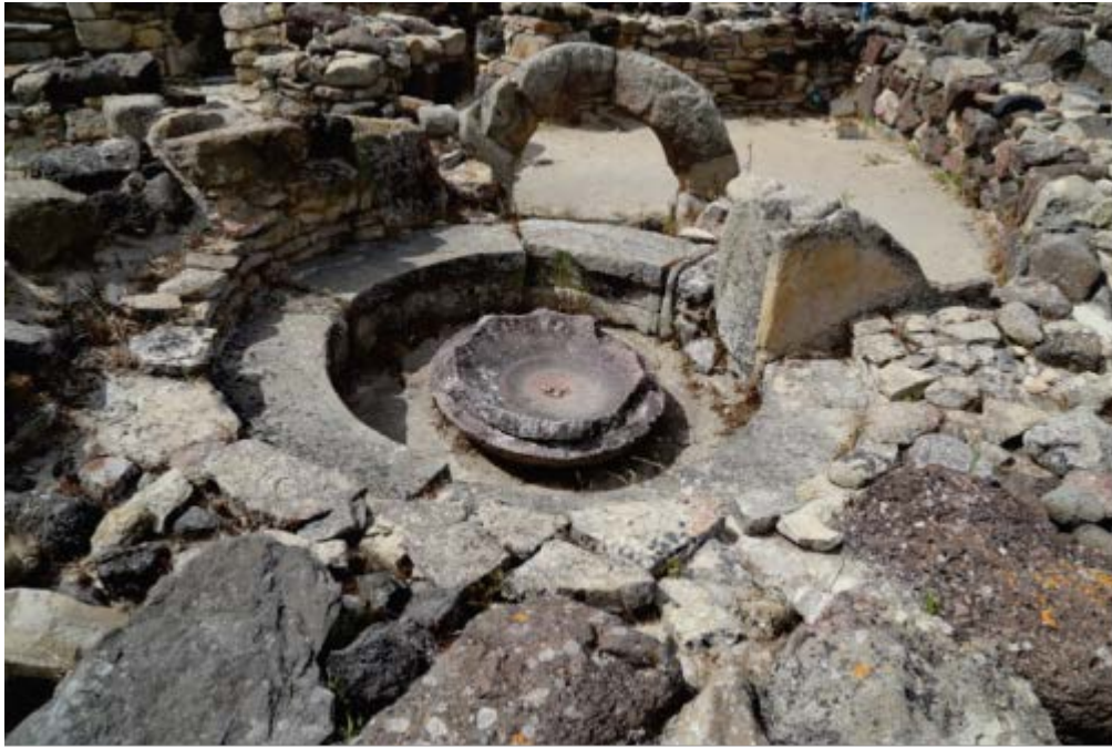
Fig. 2 - Su Nuraxi, courtyard house 20, room 65 with bench and central basin (photo by Unicity SpA).

The buildings, used for rituals inside dwellings, are round, with a stone bench around the perimeter. A stone basin with a shaped foot was placed in the centre of the room, on a stone floor, and sloping in the direction of one or more holes open at the base of the seats, for the liquids to flow away (fig. 3).