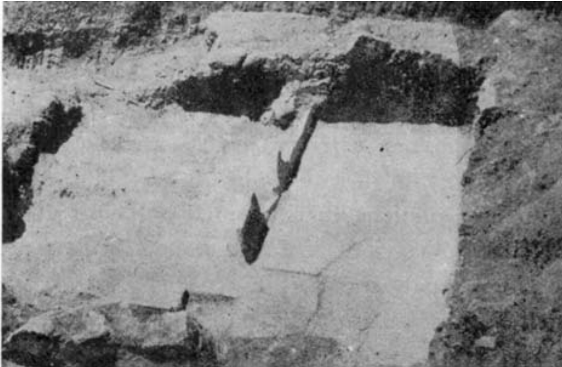
Fig. 3 - Detail of room A of the Roman house of Marfudi (from Lilliu 1946, fig. 7, p. 191).