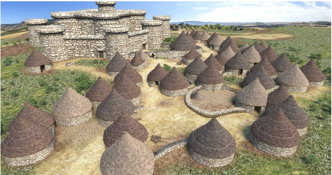
Fig. 1 - Render of Su Nuraxi di Barumini (photo by Unicity S.p.A.).

There are also small amounts of fragments of sea molluscs, the result of occasional consumption but that proves the contact with the coast.