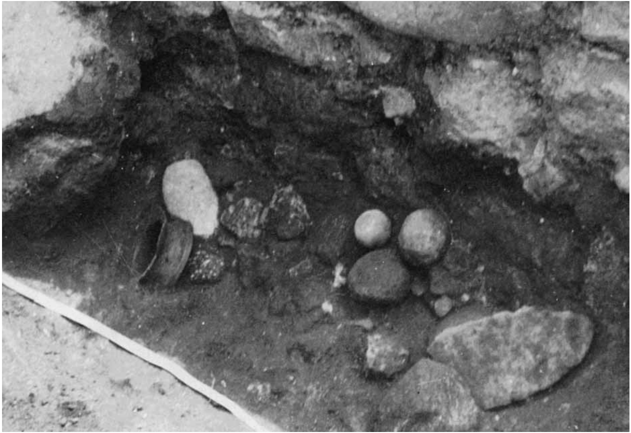
Fig. 4 - Barumini, Su Nuraxi. Room 135: pottery, mills and pestles (from Lilliu, Zucca 1988, fig. 21, p. 44).