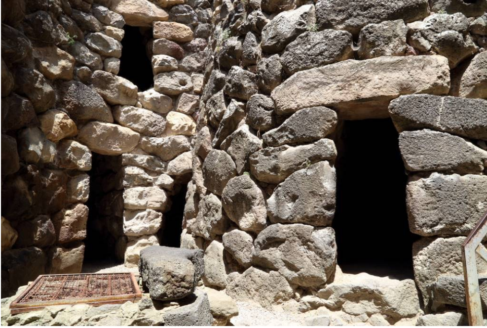
Fig. 2 - Detail of the courtyard where the entrance door to the chamber of tower E can be seen in the centre.