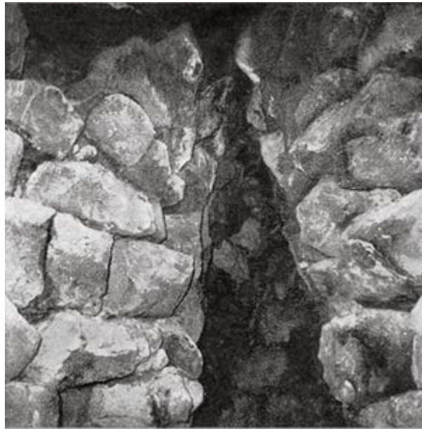
Fig. 3 - Entrance foyer to tower E (from Lilliu 1962, Table LXV.2, page 337).

To the left of the corridor entrance, there is a semi-circular sentry box, that changed during Phase C (12th-10th centuries B.C.) into a basin to collect rainwater. Tower E that was originally formed by two chambers one above the other, has a base diameter and vault height of 4.40 metres x 8.40 metres. There is a small circular well (internal diameter