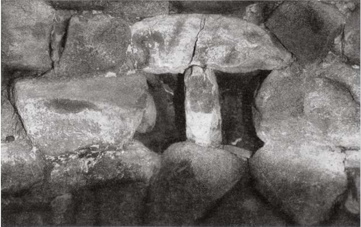
Fig. 3 - Pair of embrasures in the chamber of tower C (from Lilliu, 1962, Table LXIV.3, p. 336).