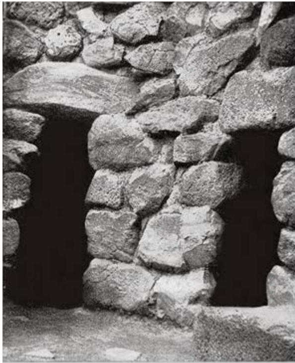
Fig. 2 - Detail of the courtyard where the entrance door to the chamber of tower C can be seen on the left. (from Lilliu, 1962, Table LXIII.4, p. 335).

Inside the chamber in tower C, to the left, there is a round cell covered by a vault (2.60/1.80 metres in diameter and 3.86 metres in height), preceded by a low architrave hatch of 1.07 metres height. It is presumed it was used as a bed or to store arms.