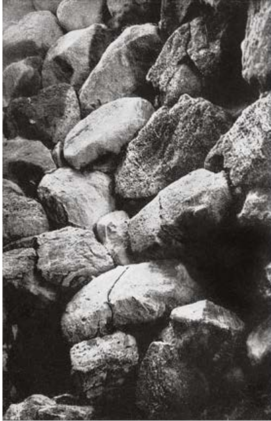
Fig. 3 - Embrasures from the upper row in the chamber wall of tower B (from Lilliu, 1962, Table LXIV.2, p. 336).