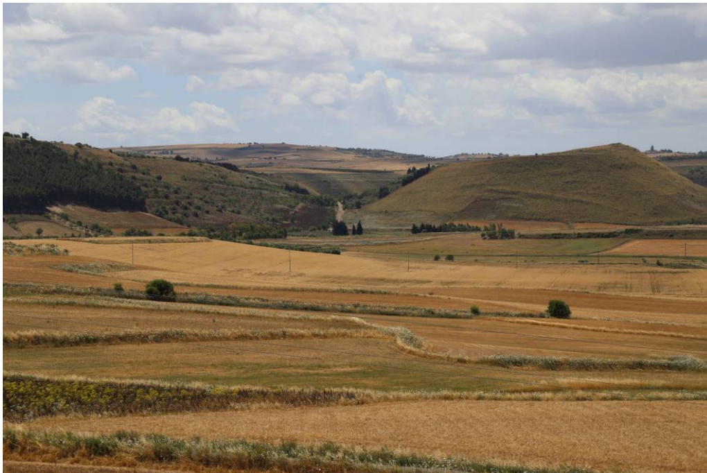
Fig. 1 - View from the keep over the valley of Pardu'e S'Eda.

The imposing keep (Phase A, 1500-1300 B.C.) is a truncated cone (base diameter 10 metres), comprising three floors with a terrace, in a polygonal work of basalt that are interlocked block with interblock and with the spaces filled with soil and shards. The tower, still standing today at a maximum height of 14.10 metres, was originally 18 metres high, providing a wide panoramic view of the valley of Pardu'e S'Eda (fig. 1).