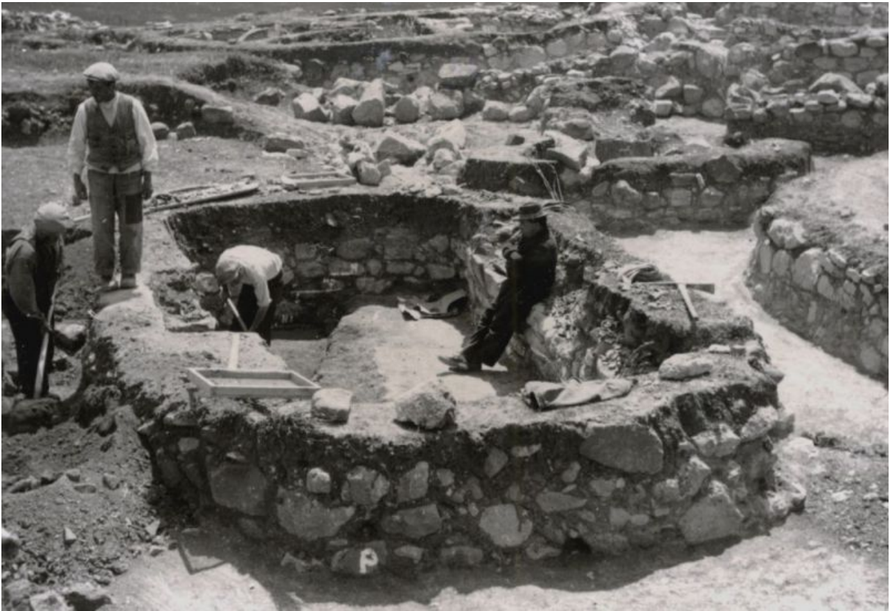
Fig. 2 - Giovanni Lilliu leads the dig of hut 135 in the village of Su Nuraxi in Barumini.

Lilliu owes his fame to discovering the Nuragic palace of Su Nuraxi, in Barumini, his birthplace (fig. 2).