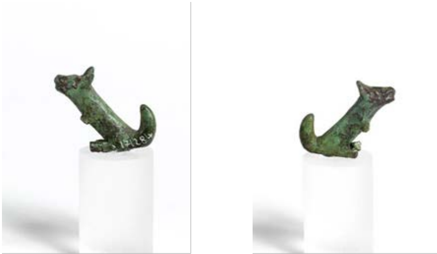
Figs. 2, 3 - Su Nuraxi, bronze statue of a dog.