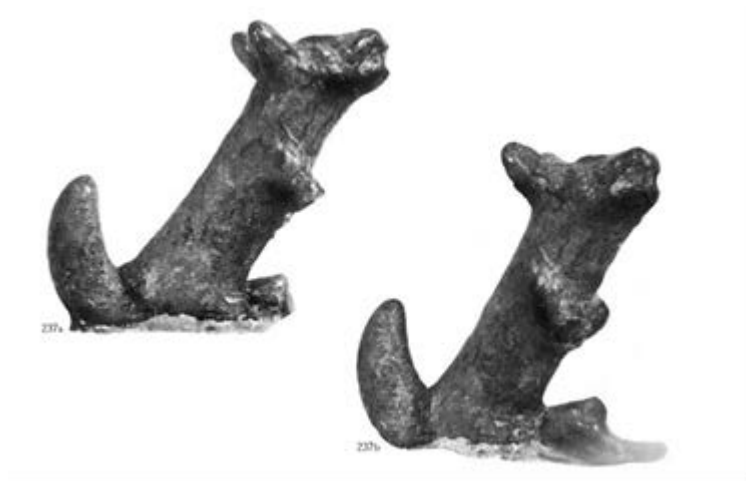
Figs. 4, 5 - Su Nuraxi, bronze statue of a dog (from Lilliu 1966, p. 350).

The item is currently on show at the National Archaeological Museum of Cagliari.